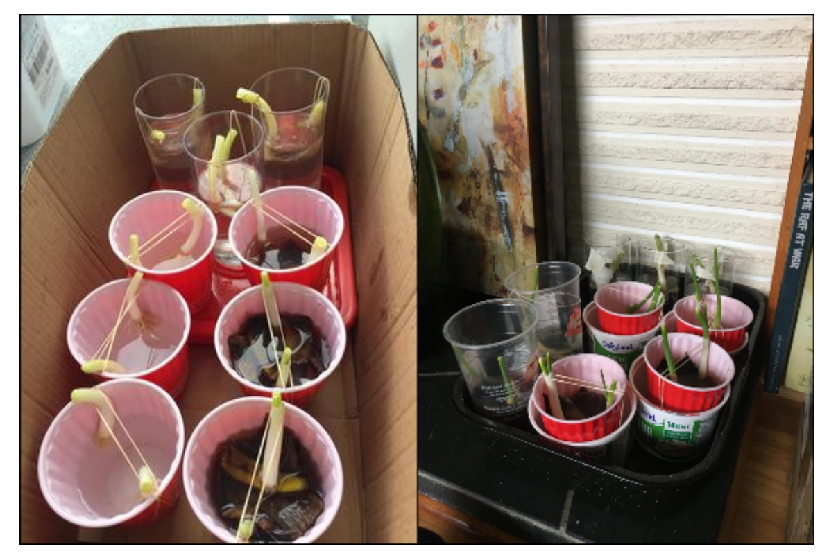
Figure 2. Experimental setup on the first day of the experiment (left) and the final day of the experiment (right).

The green onions appeared slightly wider and in some cases taller as the experiment progressed. They also changed from a light green and white colour to a darker green. Some wilting of the external layer of the bulb was observed in all treatments, but was especially prevalent in the growth inhibitor treatment group.