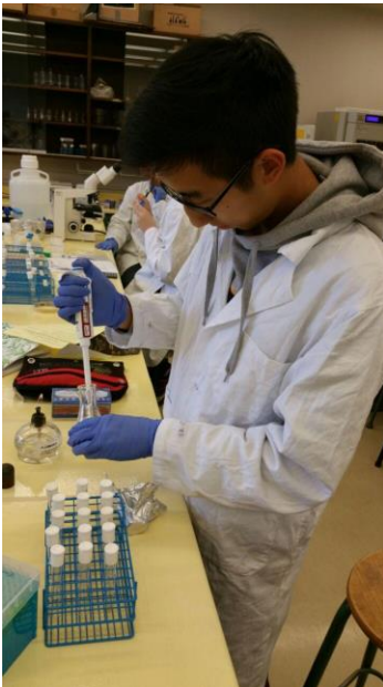
Figure 1: One of our group members diluting the yeast sample into a large test tube.

From the counts we were able to determine that we needed to dilute 312.5µL of yeast sample with 49.69mL of growth medium. We filled 12 test tubes to get three replicates for each of our four treatments. Figure 1 below shows a picture of one of our members preparing the 50mL replicates.