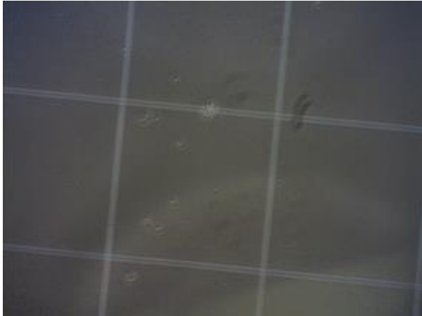
Figure 3. Saccharomyces cerevisiae at 30 degrees after 6 hours

a cloudy solution would appear. The cloudy solution may have appeared because the growth in these treatments was larger compared to the other treatments.