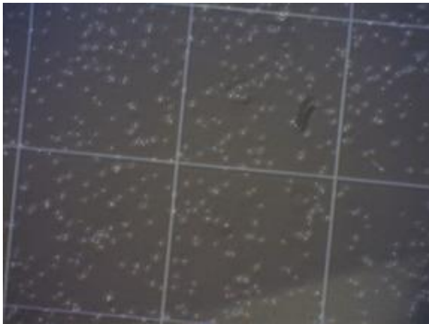
Figure 4. Saccharomyces cerevisiae at 30 degrees after 10 hours