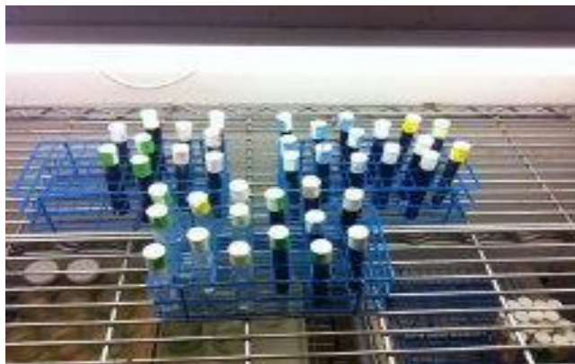
Figure 1. 40 test tubes wrapped in blue, green, red and clear acetate paper and black plastic under the same light intensity in 17 degree Celsius controlled room.

1 \times 10^4 cells/mL in order to ensure that we started the experiment with wild type and mutant samples at similar concentrations. We did this by mixing medium with the wild type sample, and the medium and the mutant sample into separate 250-mL flasks. From this dilution, we created 20 wild types samples and 20 mutant samples, each containing 5-mL of the culture and medium mix. The samples were each placed into 6-mL test tubes. Four test tubes from the wild type samples and four test tubes from the mutant samples were wrapped in one of the determined colour of acetate filters and black plastic (clear at 400-700 nm (all visible light colours), red at ~630-700 nm, green at ~550 nm, blue at ~470 nm, black at ~0 nm). There were four wild-type samples wrapped in clear; four wild type samples wrapped in red; four wild-type samples wrapped in green; four wild-type samples wrapped in blue; and four wild-type samples wrapped in black plastic. The same applied for the mutant samples. Once all the test tubes were wrapped, they were placed into test tube racks (spaced to minimize the amount of shadowing by other test tubes), and placed into a room held at a constant 17°C, at light intensity 5550 LUX; as seen in Figure 1. The resulting light intensities were: clear 5550 LUX, red 140 LUX, green 180 LUX, blue 30 LUX, and black 0 LUX. The samples were allowed to sit, while occasionally being shaken by hand.