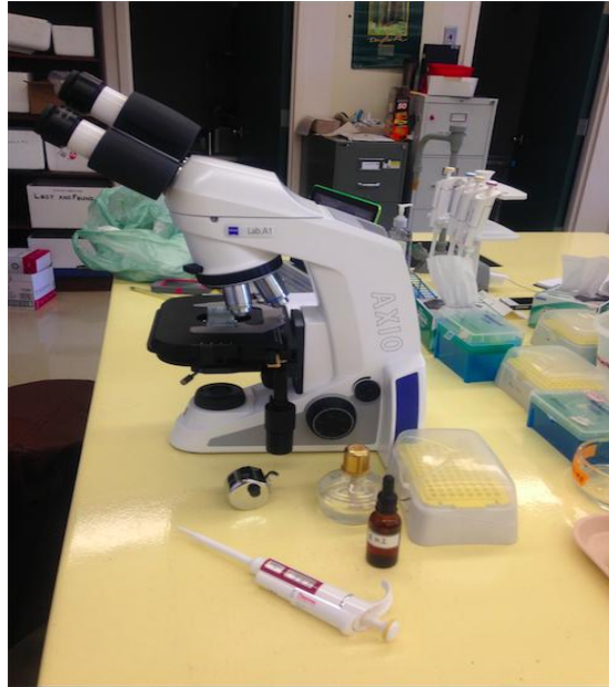
Figure 2. The initial setup for cell count on Day 0.

Day 0 - We removed 100 \mu L of C. reinhardtii wild type and mutant from respective test tubes with a micropipette and then fixed each sample with 10 \mu L of IKI. We determined initial cell concentration by performing a cell count, using haemocytometers and compound light microscopes (see Figure 2). Once extraction for the counts was completed, we placed the samples back into 17°C controlled room, to ensure temperature remained as constant as possible.