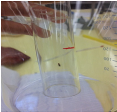
Figure 1. D. melanogaster climbing upwards to the marked 4-centimetre line.

four centimeters from its opening (Figure 1). We transferred individuals by inverting the sex-labeled vial containing flies to be tested, and connecting it to a numbered vial. Tilting the two tubes until a fly passed into the numbered vial, we minimized external stressors on the flies. After disconnecting the vials, they were again inverted to position all Drosophila back on the cornmeal medium, and then resealed. A beaker was used to cover the opening of the numbered vial.