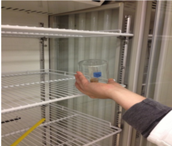
Figure 2. We inverted the tubes containing Drosophila , while inside the incubator, to ensure the fruit flies were active.

geotaxis measurement was five minutes. After each replicate was complete, we disposed of each fly as instructed.