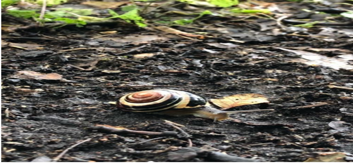
Figure 1: Capaea nemoralis is a common terrestrial snail species found in gardens in B.C.

The mean light intensity at each garden site was calculated by taking the sum of the light intensity measurements over the 17 days and dividing this sum by 17. The population size was also estimated by taking the sum of snails captured/recaptured during the trials and inserting these values into the Lincoln-Peterson formula: