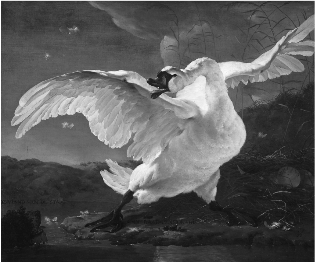
Figure 2. Asselijn: The Threatened Swan . Rijksmuseum, Amsterdam.