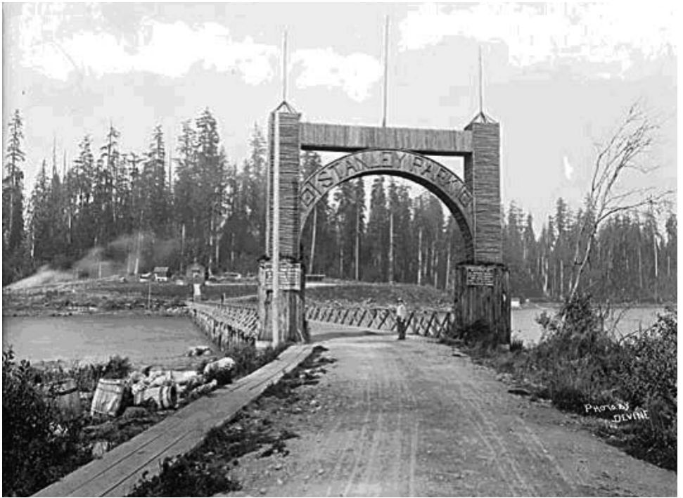
Figure 1: The appearance of the trees at the entrance of Stanley Park shown above in the 1890s and below in the 1940s illustrates the extent to which forest management work transformed the landscape of the park.