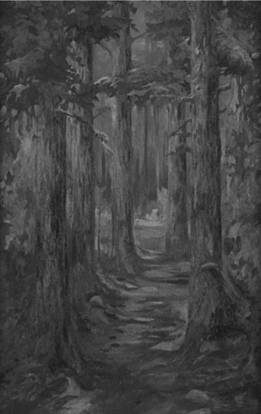
Figure 2: Winter Moonlight (Stanley Park) , 1909. Emily Carr's earliest watercolour paintings of Northwest Coast forests depicted the deep woods of Stanley Park, where she struggled to capture the unique effect of the light filtered through the branches.