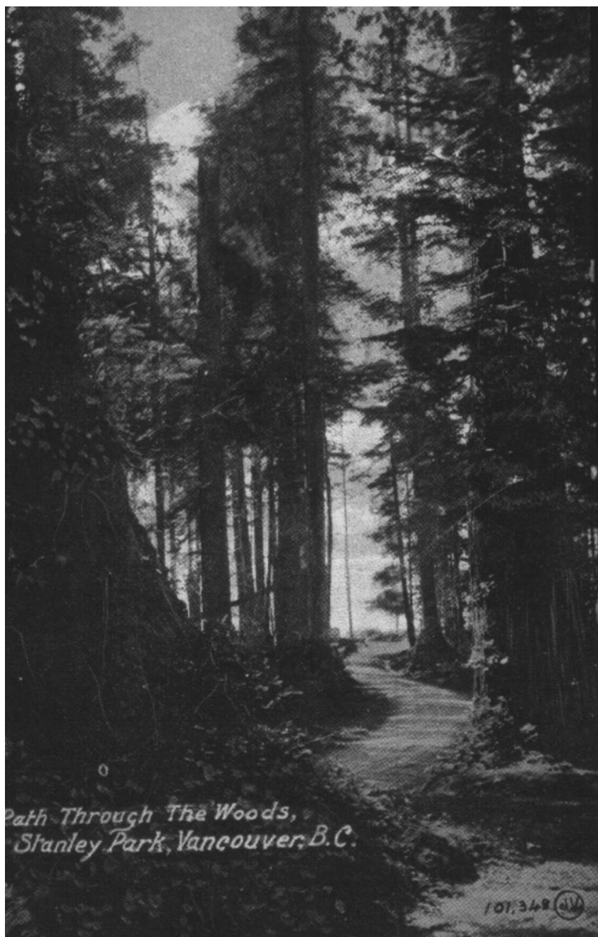
Figure 4: "Path Through the Woods, Stanley Park, Vancouver, BC," postmarked 25 March 1908.