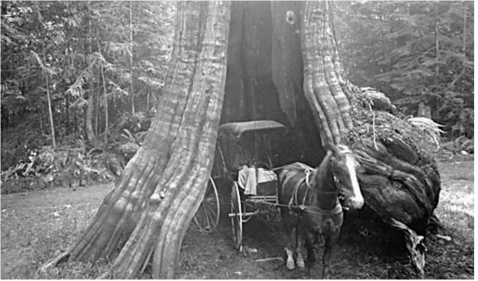
Figure 5: Posing for photographs inside the Hollow Tree has been a tourist tradition in Stanley Park since the late nineteenth century (1890).

common images is that of men and women standing next to the base of very large coniferous trees (Figure 4). The most famous example of this tourist tradition is the Hollow Tree, an enormous hollow cedar stump in the middle of the peninsula. Thousands of park visitors posed for photographs inside the Hollow Tree, even going so far as to park carriages and later automobiles inside the stump (Figure 5).