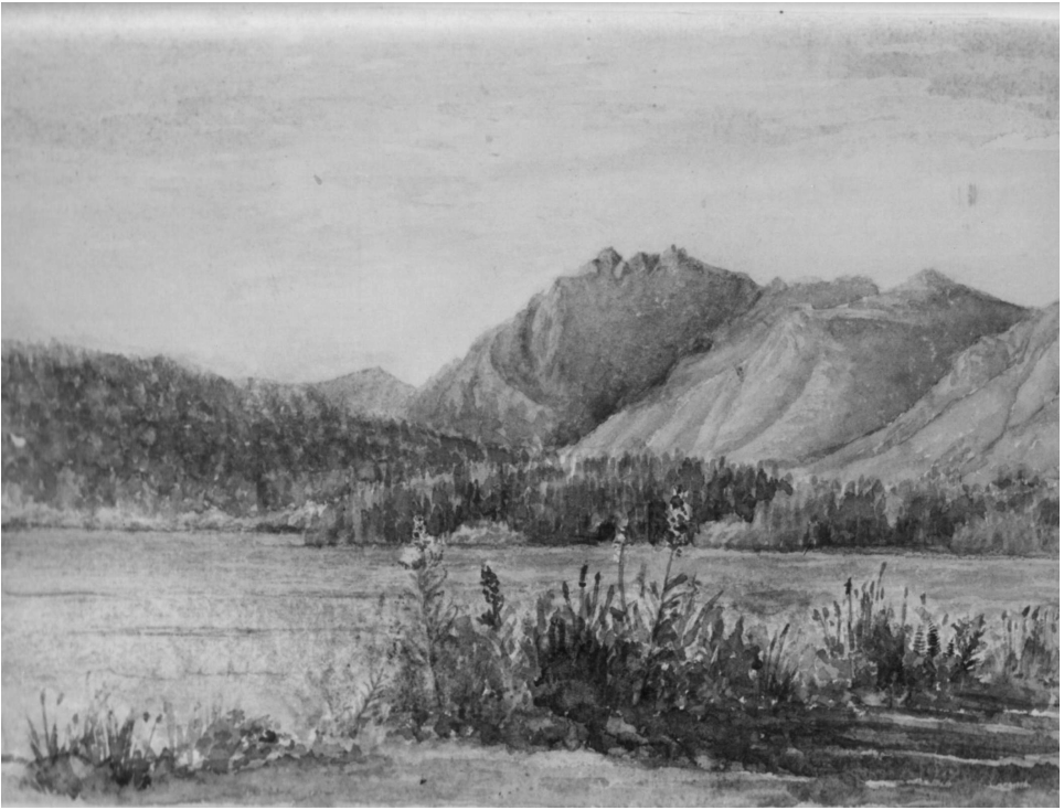
Figure 3: L.A. Hamilton's watercolour painting of English Bay, looking out at the Stanley Park peninsula, in 1885.

Vancouver's city council permission to use the nearly four-hundred-hectare peninsula as a public park. 8