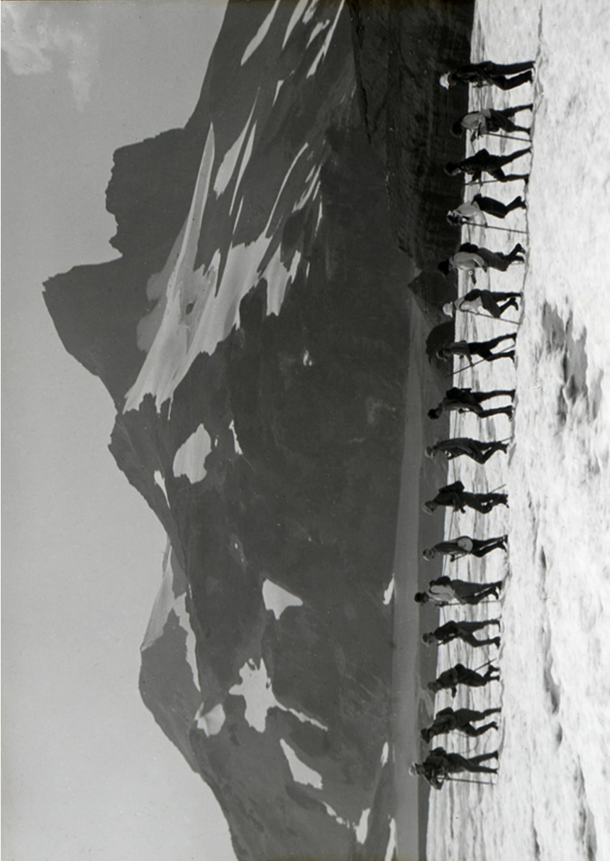
Figure 7. "John Davidson leading party on glacier," ca. 1928, University of British Columbia Botanical Garden and Centre for Plant Research, John Davidson Lantern Slide 244. Image also available online at: http://botanyjohn.org/gallery/v/ubcbgslides/2005_680_0244.jpg.html .