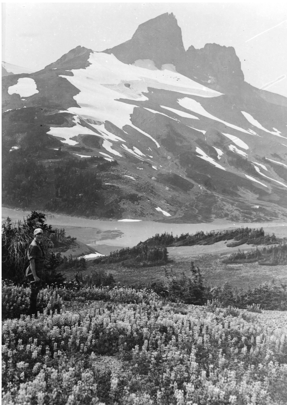
Figure 8. "Black Tusk and Helm Lake," Dorothy Ingram standing in meadow of wildflowers, ca. mid- to late 1910s, City of Vancouver Archives, cva 660-226. Image also available online at: http://botanyjohn.org/gallery/v/cvaslides/2007_660_0226.jpg.html .