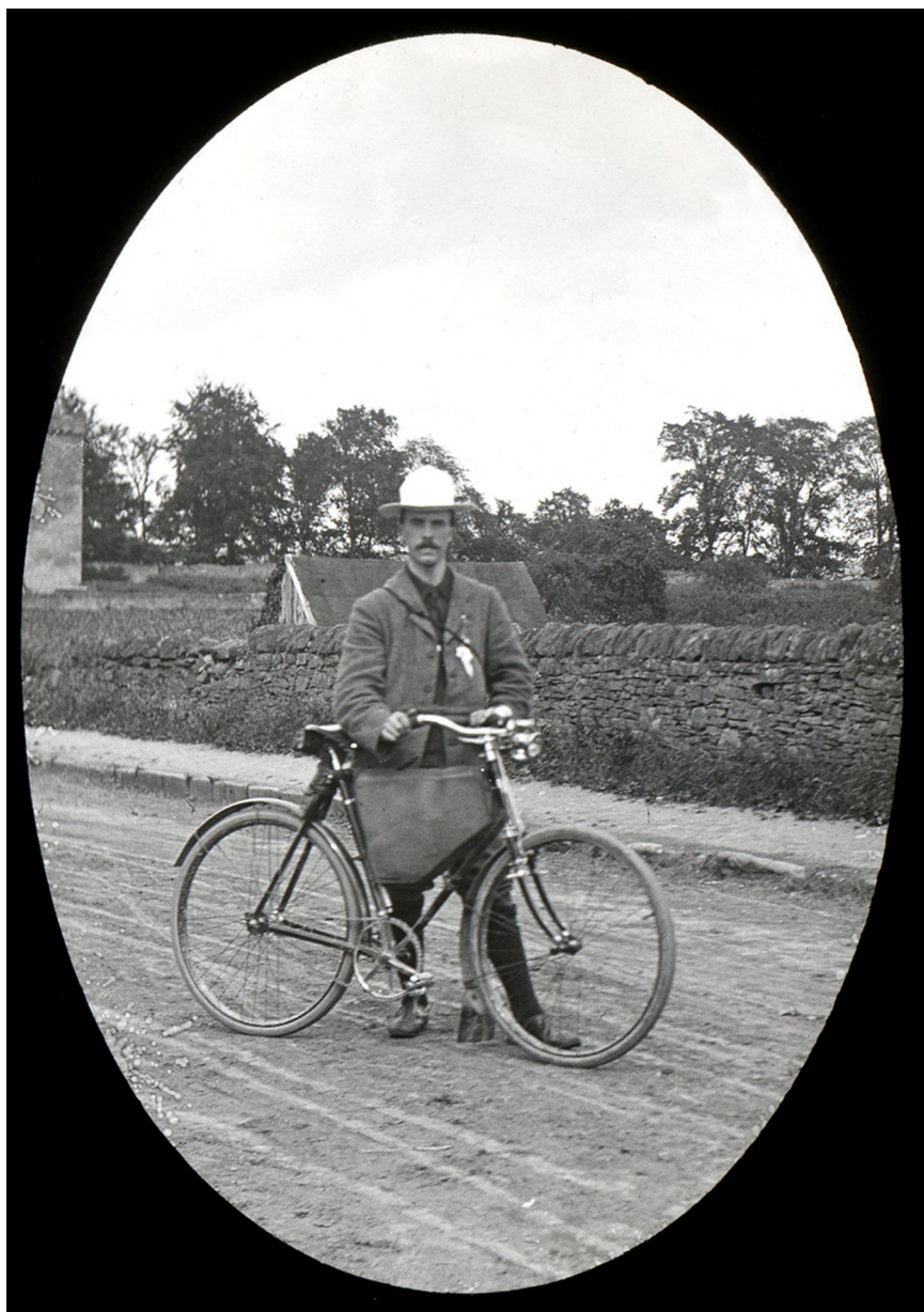
Figure 1. "J.D. Cyclist," unknown photographer, n.d., University of British Columbia Botanical Garden and Centre for Plant Research, John Davidson Lantern Slide 60. Image and metadata also available online at: http://botanyjohn.org/gallery/v/ubcbg-slides/2005_680_0060.jpg.html .