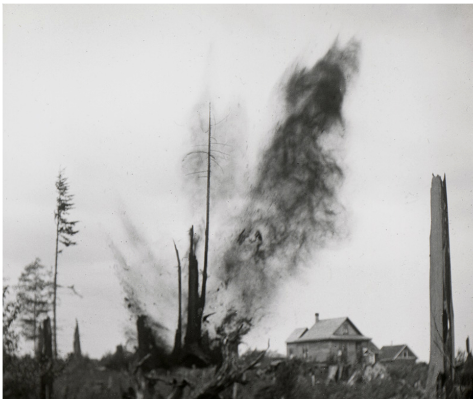
Figure 3. "Blasting stump," ca. 1911, University of British Columbia Botanical Garden and Centre for Plant Research, John Davidson Lantern Slide 591. Image also available online at: http://botanyjohn.org/gallery/v/ubcbgslides/2005_680_0591.jpg.html .