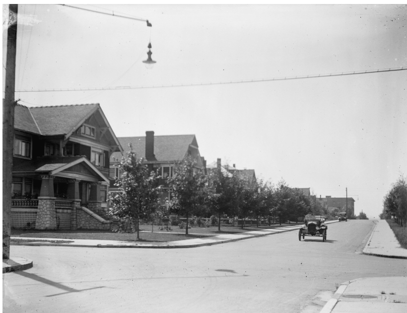
Figure 6. "City beautification," view of planted trees on 12th Avenue West and Spruce, ca. 1920, City of Vancouver Archives, cVA 660-002. Image also available online at: http://botanyjohn.org/gallery/v/cvaslides/2007_660_0002.jpg.html .