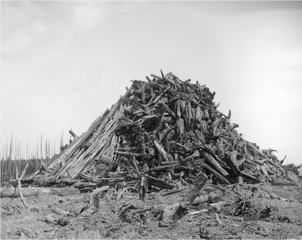
Figure 4. "Land clearing," ca. 1914, photograph by Jean Davidson, City of Vancouver Archives, cva 660-331. Image also available online at: http://botanyjohn.org/gallery/v/cvaslides/2007_660_0331.jpg.html .

This mess of stumps, fire scars, and bushy second growth, and his professional duties as newly appointed provincial botanist and, later, professor at UBC, led Davidson to advocate City Beautiful principles and to initiate a civic Arbor Day. He believed that the orderly reintroduction of native trees and flowers into the now decrepit cityscape was essential to raising a virtuous younger generation. Figure 5, "Land sale," an image taken between 1915 and 1917, shows Vancouver at what Davidson considered its worst. With the tree cover gone, the ground is eroding into a muddy wasteland. The few modest houses do nothing to compensate for the ruin. However, Figure 6, "City beautification," taken a few short years later in an adjacent part of the city, provides an example of the antidote. In time, the private gardens and wide tree-lined boulevards would compensate for the flora removed during the city's creation.