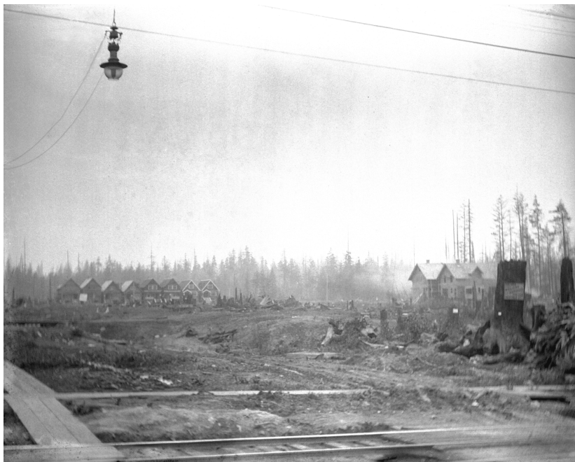
Figure 5. "Land sale," view of land sales property, possibly near West 42nd Ave and West Boulevard, ca. 1915-17, City of Vancouver Archives, cVA 660-344. Image also available online at: http://botanyjohn.org/gallery/v/cvaslides/2007_660_0344.jpg.html .