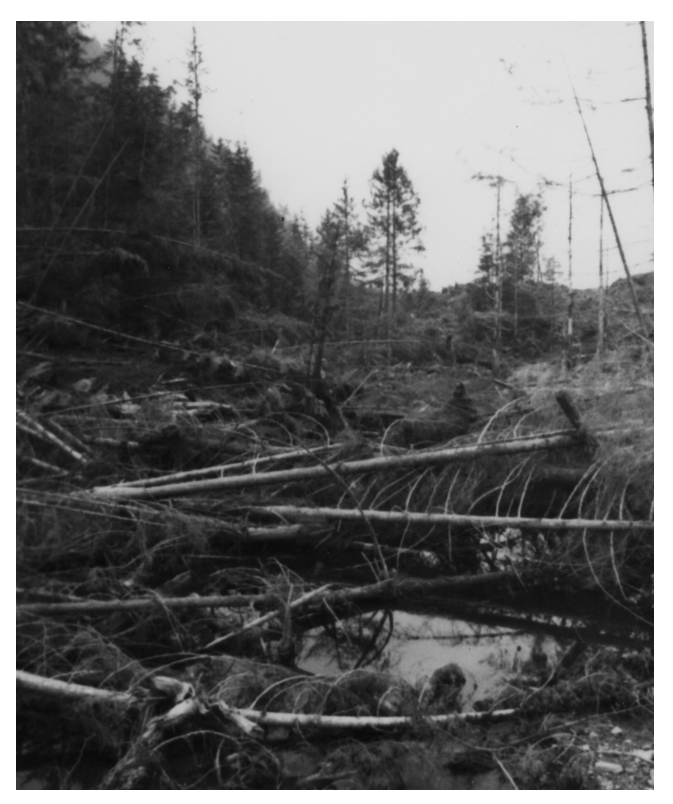
Logging damage to small stream, Quadra Public Sustained Yield Unit, 1972.

Nevertheless, a more consultative, if not exactly collaborative, approach to planning had begun to take shape. Around the province fisheries officers handled hundreds of timber cutting referrals, attending meetings with BCFs officials and company managers to discuss logging plans. "Nothing engages our attention at present more than the effect on fisheries of our cutting plans," one north coast forester noted. But the BCFWB remained confined to a frustrating advisory role, "trying to minimize damage" to its resource interests by providing input to a stronger agency holding the ultimate authority to make timber allocation decisions. 63