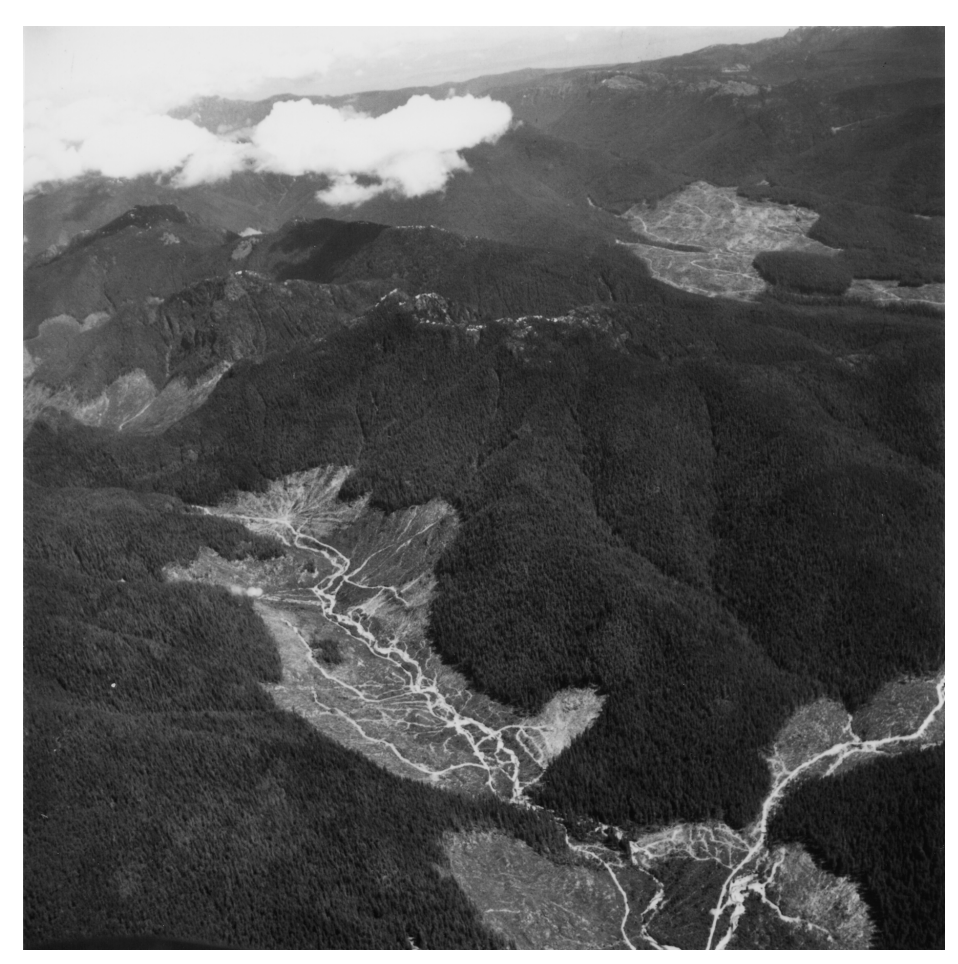
Clearcutting north of Cowichan Lake, 1965. Source: BC Archives, NA-22420

By the early 1970s, however, an increasingly embattled Forest Service responded with its Guidelines. Ignoring pleas for a mandatory leavestrip policy and a planning partnership with fisheries agencies, the BCFs acted unilaterally in adopting its patch logging restrictions in May 1972. "The public is becoming more and more concerned with the environment ... and is demanding protection and proper management of its resources,"