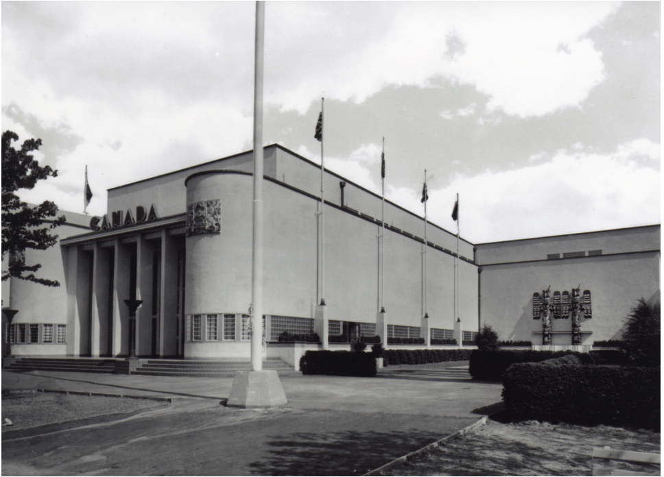
Exterior shot of the Canadian Pavilion showing Mungo Martin's twin poles.

fair's central symbols. 69 Controls were imposed on the designs of the buildings, which tended to look much like each other. Each nation's pavilion was encouraged to have sheer white planar walls, a minimum of decoration, and spare curving and straight lines.