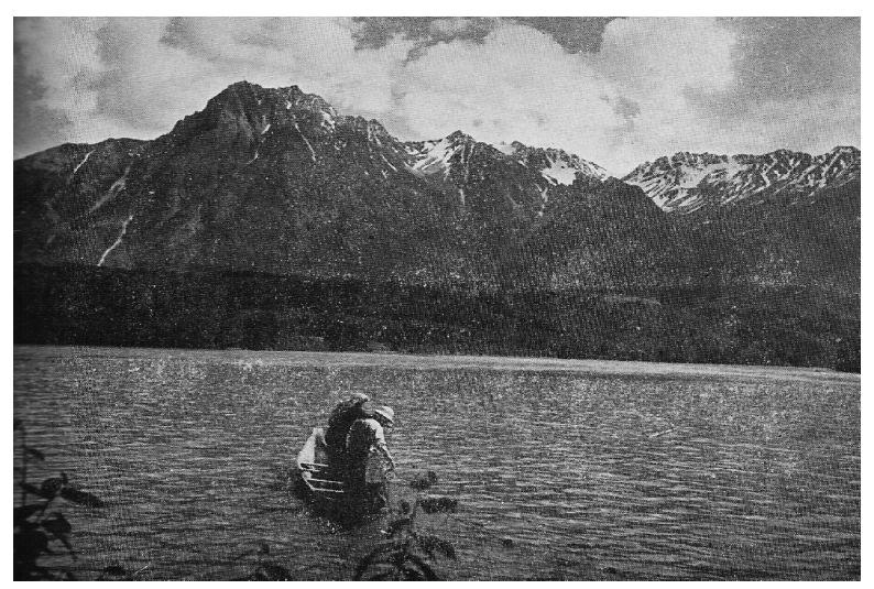
Figure 7. "Indians Fishing Off the Coast of British Columbia," in McInnis, Canada: A Political and Social History , 30.

vanished."<sup>86</sup> The second image, in contrast, depicts modern, civilized, and ambiguous figures, identifiable as indigenous peoples only by the title "Indians Fishing Off the Coast of British Columbia" (see Figure 7). The juxtaposition of these two images suggests that the desirable path