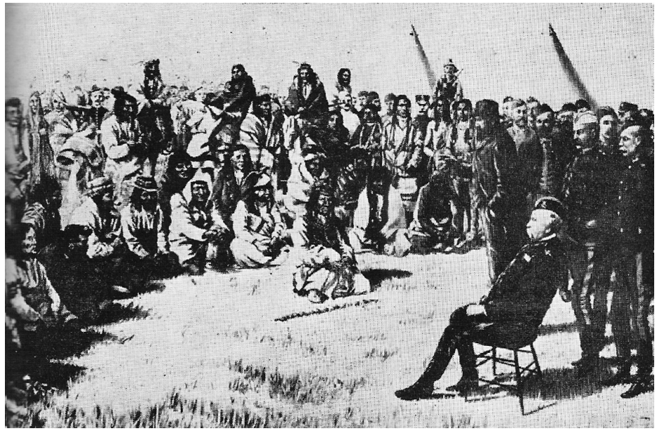
Figure 5. "The Surrender of Poundmaker," in McInnis, Canada: A Political and Social History, 318.

in the mines.<sup>"84</sup> In essence, textbooks suggest that indigenous peoples had been given numerous opportunities to contribute to the capitalist economy and to the progress of the Canadian nation. Nevertheless, Dorland's Our Canada summarizes the situation, reflecting the assimilationist policy of the postwar period: "Adaptation or extinction seems to be the hard alternative facing the North American Indian to-day."<sup>85</sup>