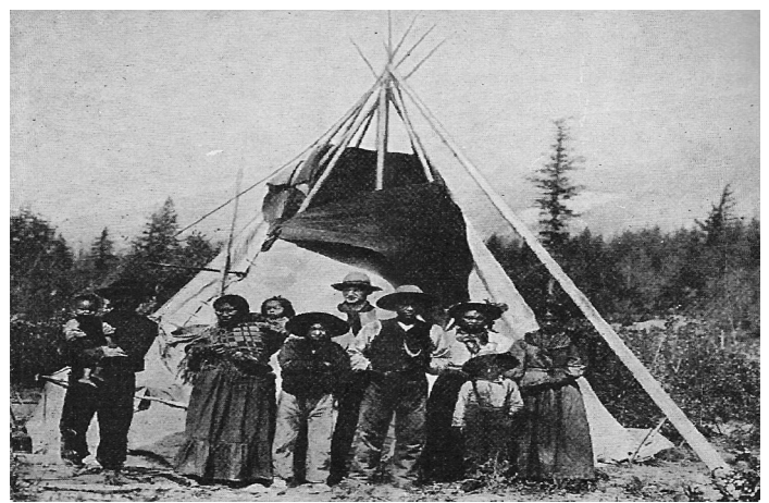
Figure 2. "An Indian Camp At Tête Jaune Cache, B.C. The Indians are Shushwaps," in George Cornish, Canadian School Geography , 257.

Columbia is gradually bringing civilization to indigenous communities was further suggested by two photographs (Figures 1 and 2) included in George Cornish's geography textbook.