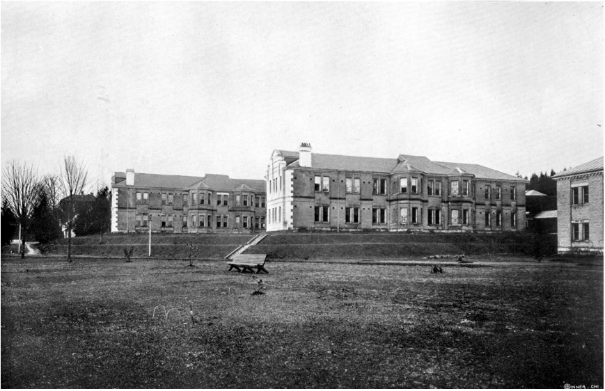
Figure 6. Two detached wings finished in 1897 and 1898, respectively. Main building is to right of photo (not shown); at far left is Lawn House.