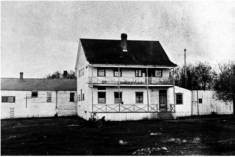
Figure 2. Royal Hospital, Songhees Indian Reserve, Victoria, Vancouver Island, became Victoria Asylum (1872-78).

Canada. 2 First, reflecting British Columbia's demographic make-up, 3 the social composition of the asylum was unique, with 80 percent of its population male and roughly one in ten a Chinese male (see Table 1 and Table 2). Second, "moral therapy" – using patient labour as a primary curative treatment for insanity – came relatively late to British Columbia as the Provincial Asylum was not officially opened until 1878 and moral