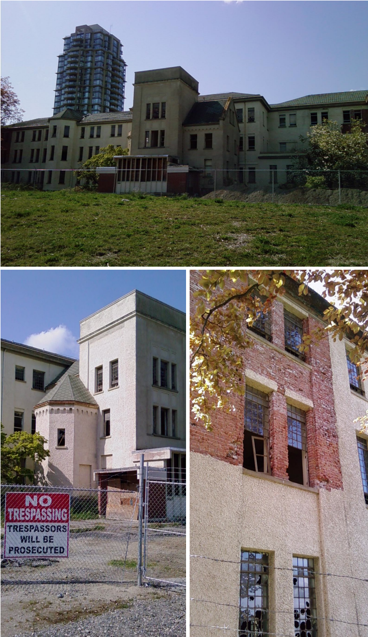
Figure 1. Contemporary photos of former Woodlands Hospital site, New Westminster, British Columbia. The centre block of the original 1878 Provincial Asylum for the Insane is contained in the structure in the top and left photos. Windows of building block of wards A and B are pictured at right. Condominium tower of 2008 Victoria Hill residential development pictured at top.