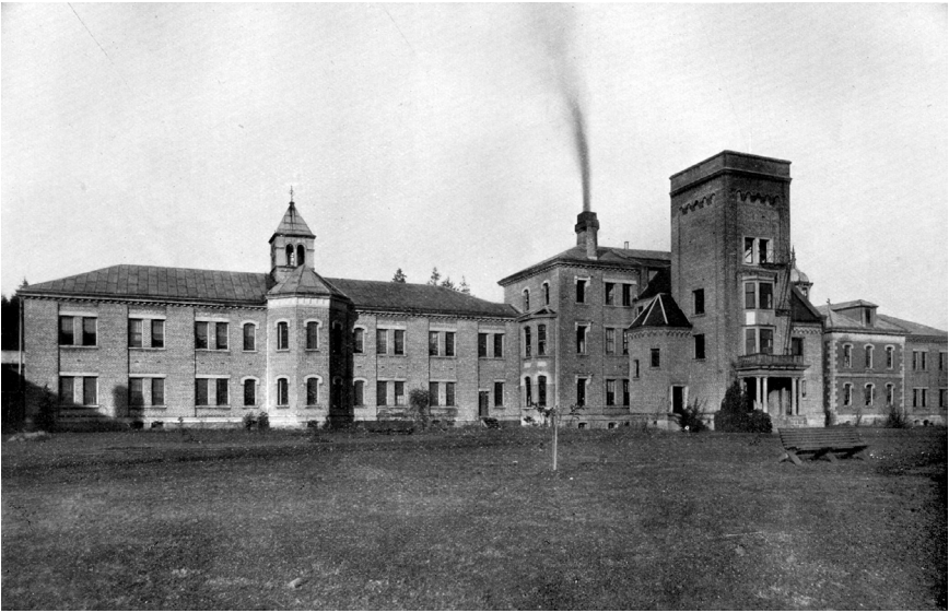
Figure 3. Three-storey administration building and wing (left) built in 1890. Tower and superintendent's residence added to front of building, 1895.

Ross was responsible for determining and supervising living places and workplaces as well as various activities on the female ward. 14