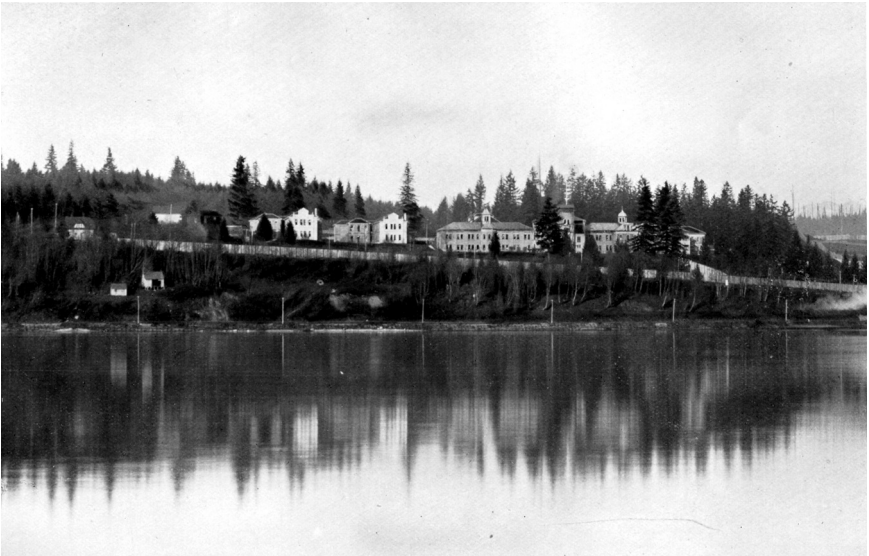
Figure 7. View of the asylum from across the Fraser River, 1902. Main building is on the far right; end faces of the 1878 and 1898 wings are to the left.