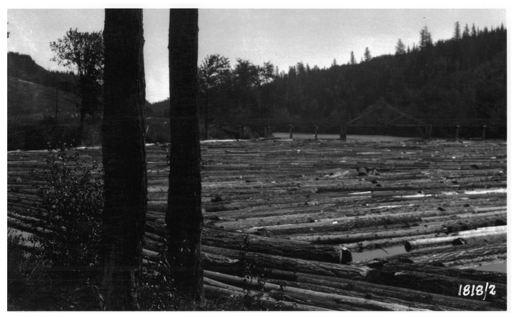
Start of Stellako River Log Drive, 1929.

the mill reopened within a couple of years as Fraser Lake Sawmills. Demand declined during the 1930s, but logs and ties continued to come down the Stellako, and the mill survived the Depression by sawing for the local construction market. <sup>15</sup>