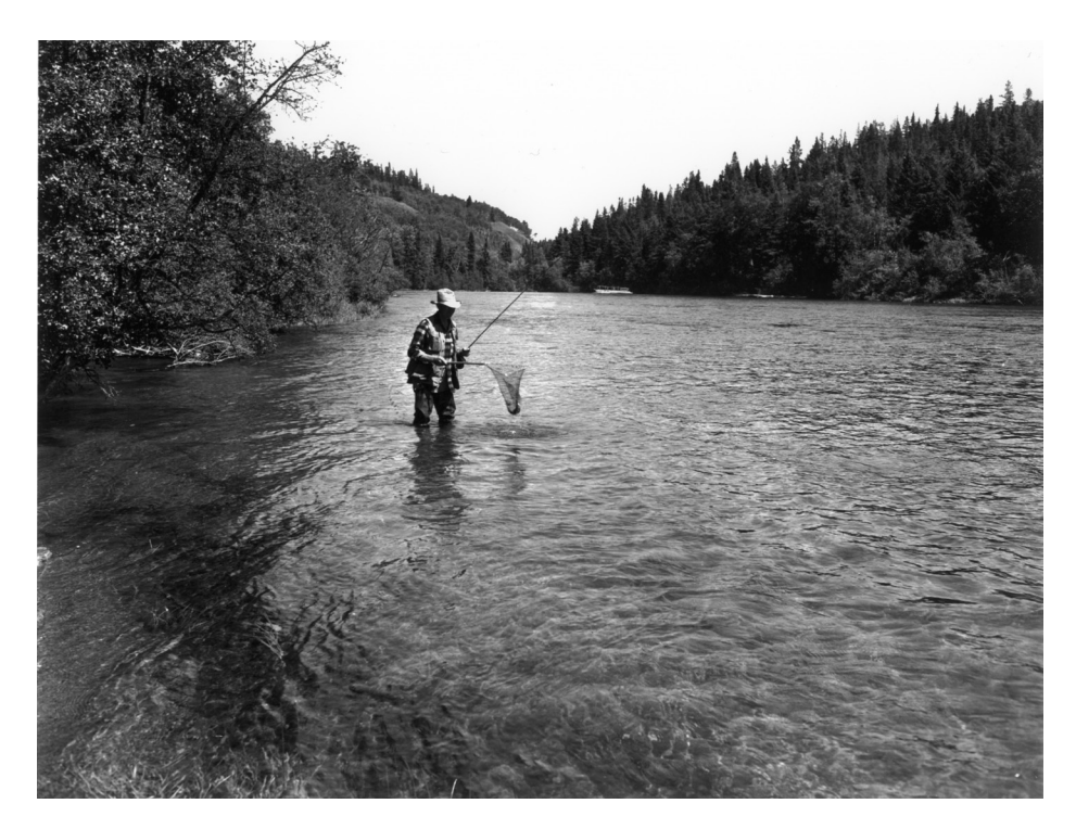
Trout Fishing on Stellako River, 1950s.

Yield Unit operators preference in timber acquisition. Quotas quickly became commodities, and Fraser Lake Sawmills went on to buy up a large number of portable sawmills to acquire their quotas, including several along the west shore of Francois Lake.<sup>19</sup>