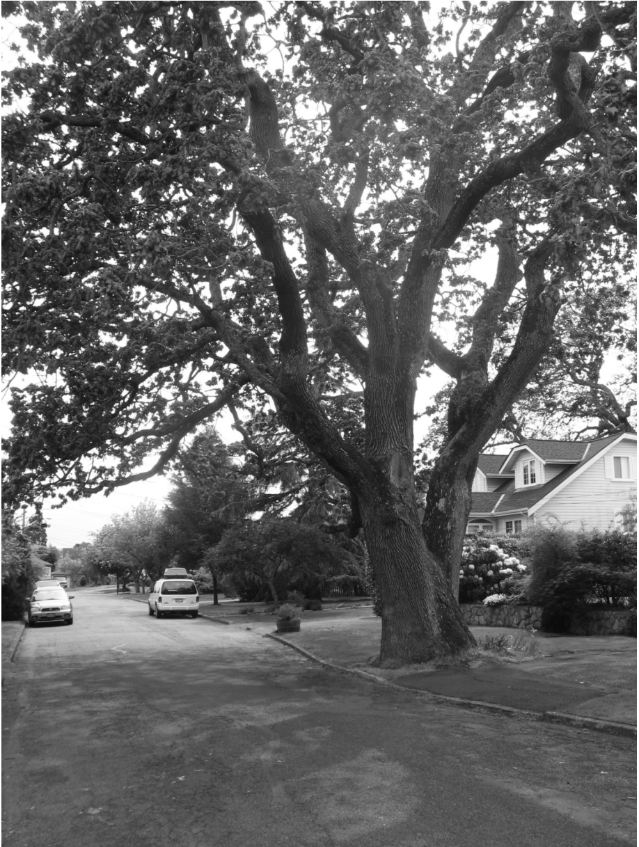
A mature Garry oak on Heron Street, Oak Bay.