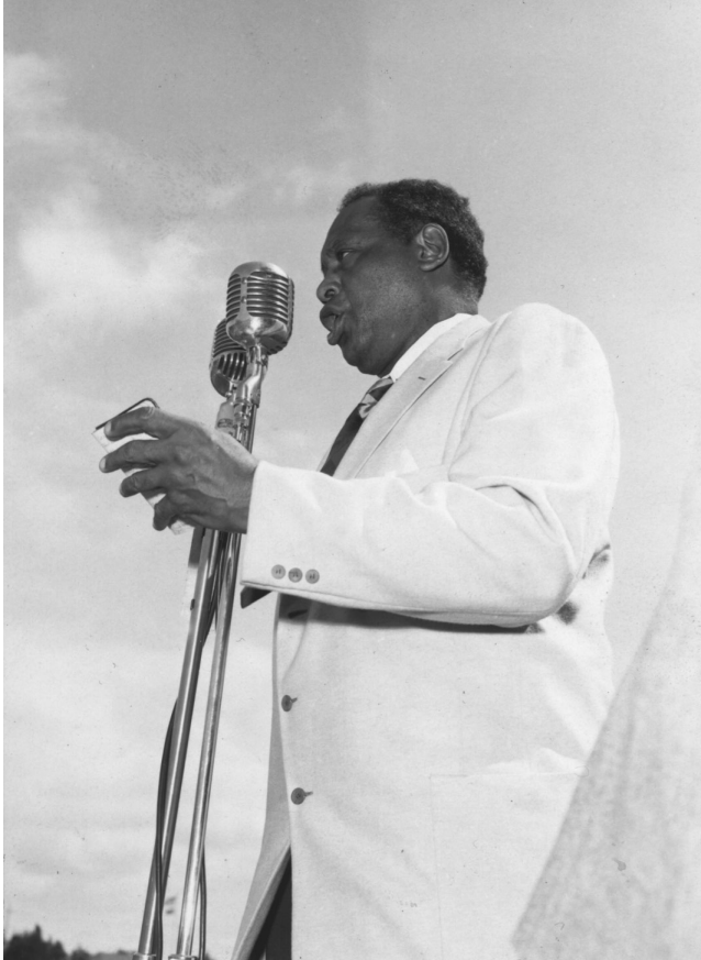
Figure 1. American singer and activist Paul Robeson sings at the 1955 Peace Arch concert. He awed large crowds at all four concerts with his rendition of “I Dreamed I Saw Joe Hill Last Night.”