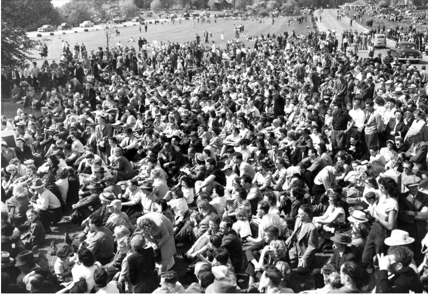
Figure 4. Large and admiring crowds travelled from as far away as the Kootenays to hear Robeson, an outspoken critic of US president Harry Truman, sing famous songs like “Ol’ Man River.”

people.” 71 Whether Mine-Mill managed to get another bank loan to assist with concert costs is not mentioned, but the News reported that $1,090 was collected at the intermission.