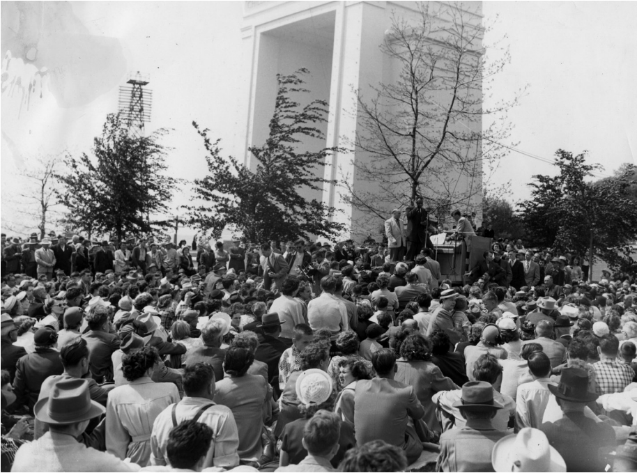
Figure 3. Mine-Mill organizers claimed that the first of four concerts, held at the Peace Arch in Blaine, WA, in 1952, attracted 40,000 admirers, mostly from the Canadian side of the border near Vancouver.