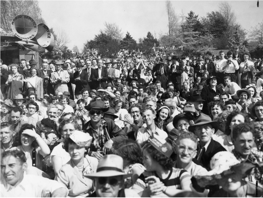
Figure 5. Mainstream media reports focused on the traffic jams at the 1952 concert, while labour and left publications reported on the substance of Robeson's anti-colonial, anti-racist remarks.