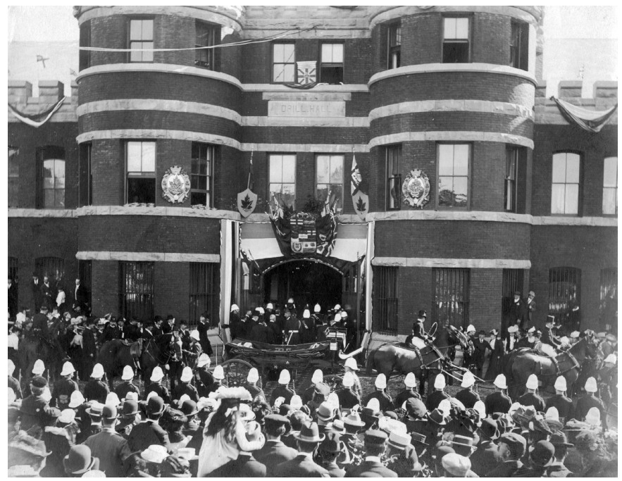
Figure 3. Vancouver's Beatty Street Drill Hall, home of the 6th Regiment, Duke of Connaught's Own Rifles, after its opening by the Duke and Duchess of Cornwall and York on 30 September 1901.

white smoke may have been amid this nostalgia for gunpowder, modern rifles and propellants were on the verge of conferring a decided advantage on entrenched infantry armed with rifles capable of hitting massed targets at a range of 3.2 kilometres. From its inception in a meeting at the Victoria Mechanics Institute in 1874 and first competitions at Clover Point, the BC Rifle Association grew to include both militia and civilian members. From 1899 until the onset of the First World War, British Columbia was never without representation on the Canadian rifle team at the great Imperial competition at Bisley.<sup>51</sup>