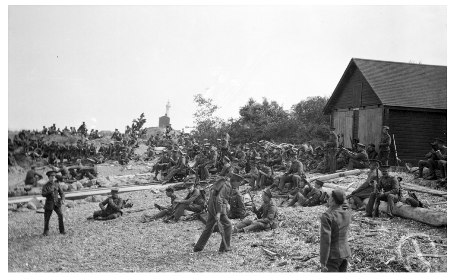
Figure 5. Militia units at rest on the beach in 1914. Before the First World War, units from Vancouver frequently crossed the Strait of Georgia to conduct joint training exercises with their counterparts in Victoria.

independent squadron in the Nicola Valley appear to have been of British descent. At the same time, the squadron in Kamloops was said to be "very well horsed and boasted some of the finest riders in the world." These "up-country cowboys" of the interior regiments attended annual camps of instruction wearing chaps and Stetsons, and the regimental march of the 31st BC Horse was sung to the tune of "The Farmer's Boy."62 In 1910, these volunteers demonstrated their sense of English propriety adapted to local conditions during a dance at Nicola's Dryad Hotel, when some "enemies of law and order came up from Merritt with the avowed purpose of creating a scene." After attempting to placate the rowdies by buying them several rounds of drinks, these persons were "returned to Merritt sadder and, it is to be hoped, wiser men – for they were soundly thrashed by the volunteer police of the squadron."63 At the same time, even among regiments that on occasion thought of themselves as "cowboys," the militia remained a British institution in what Reginald Roy describes as an "age of confidence ... in the Okanagan, in British Columbia and in the Empire as a whole. Many of the men ... were recent immigrants from Great Britain or were first generation Canadians and were quite conscious of the imperial bond. Men still spoke of England as 'home'