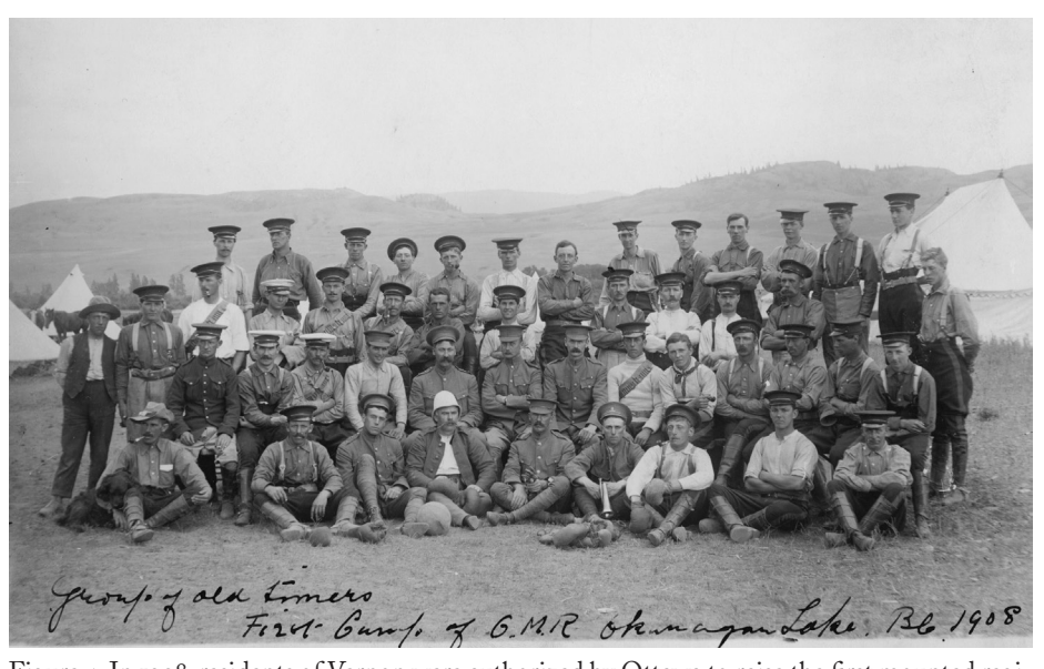
Figure 4. In 1908, residents of Vernon were authorized by Ottawa to raise the first mounted regiment in the province. Pictured here are some of the first members of the Okanagan Mounted Rifles, predecessors of today's British Columbia Dragoons.

The social activities of these newly formed interior regiments did vary somewhat from those on the coast, being directed more towards horse races and tent-pegging competitions in which riders would attempt to pull up horseshoe-shaped tent pegs with lances. However, the ethnic composition of the new regiments did not vary tremendously from the pattern set on Vancouver Island and the Lower Mainland. Judging from their names, all officers of both the Okanagan Mounted Rifles and the