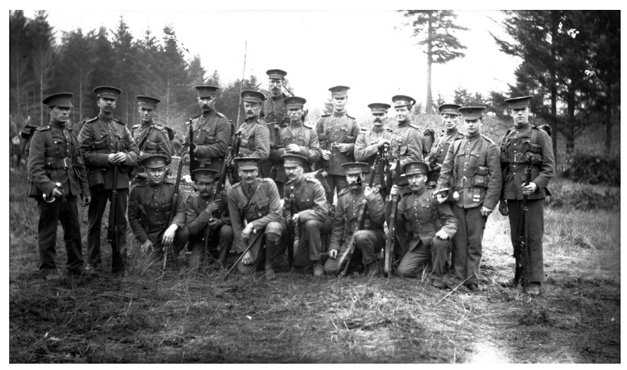
Figure 1. Officers and men of a British Columbia militia regiment in 1914. During the First World War of 1914-18, British Columbia had the country's highest per capita rate of voluntary enlistment for overseas service.

tensions between Britain and the United States during the American Civil War. The third, the Seymour Artillery Company, was formed in New Westminster in 1866 as a sort of knee-jerk reaction to the Fenian raids taking place on the other side of the continent and warnings of related conspiracies in Victoria.8 During periods of alarm, men of these two communities not only enrolled in the militia but many also purchased uniforms at their own expense and took part in unpaid training with the limited quantities of guns, rifles, and ammunition that had been sent by the War Office. Once the crisis passed, however, interest quickly waned and the newly formed units usually fell into decline, ill-equipped and struggling to maintain recruitment. As with any volunteer militia, momentum could not be maintained without active community involvement, a situation that was made abundantly clear following British Columbia's entry into Confederation.