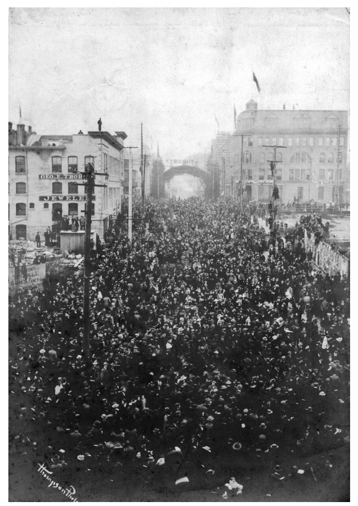
Figure 2. View of Granville Street from the CPR Station as Vancouver welcomes soldiers returning from the Boer War. In the decade that followed, British Columbian veterans of the war in South Africa successfully pressured for the formation of new militia regiments in their province.

of officers and men" it was hoped that the battalion would continue to thrive. ^{44}