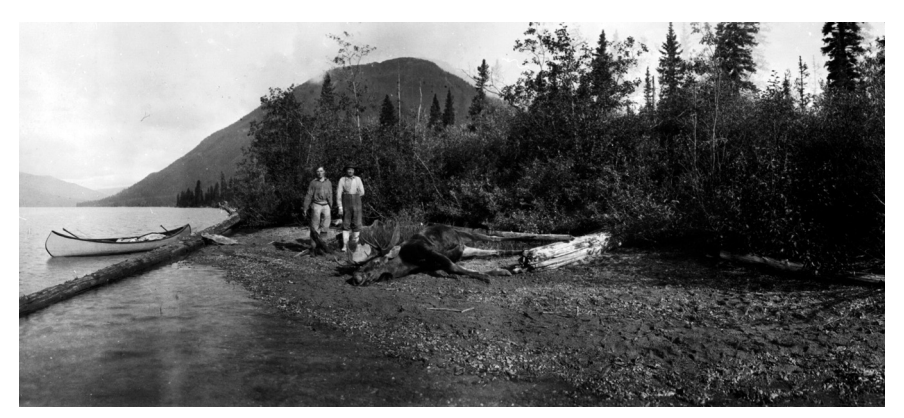
Figure 3. Hunters and dead moose at the Bowron Lake Reserve, circa 1930.

is the fact that sportsmen were one of the key sources of funding for the game department, and Williams suggested that they should rightfully expect to get something in return for their investment.<sup>117</sup> Even more than naturalists and guides, sportsmen were at the centre of conservation as an ethos of environmental management at the Bowron Lakes Game Reserve.