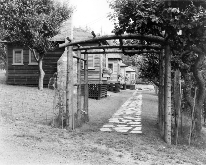
Figure 7. A row of rustic but uniform Bowen Island Resort cottages, with carefully tended window boxes, and fruit trees, ca. 1949.