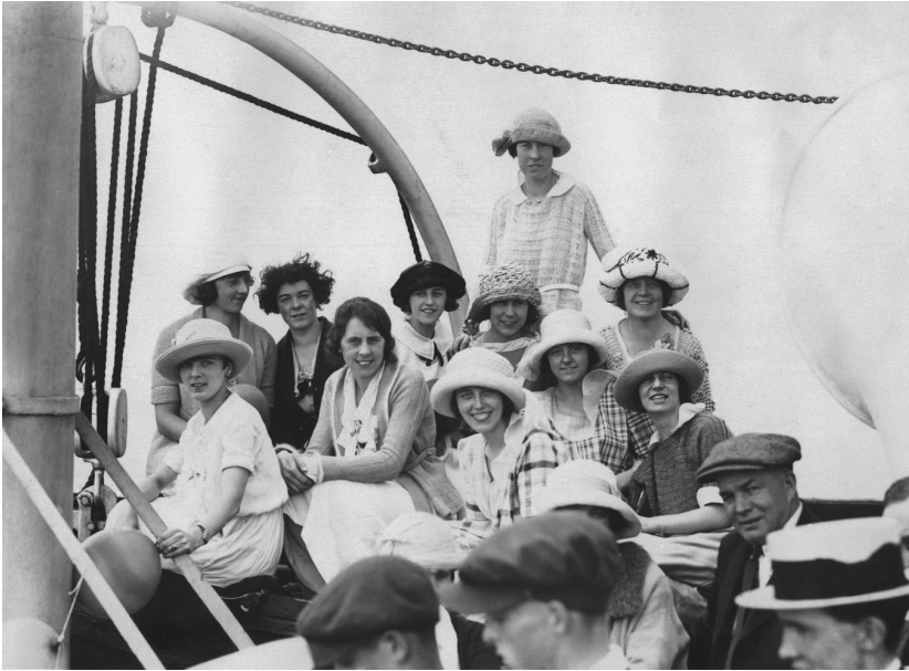
Figure 15. Spencer's Department Store sales clerks en route to or from the annual company picnic on Bowen Island. In this undated photo, the young women pose in their summer finery, while the young men are in the shadowy foreground.