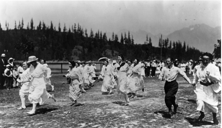
Figure 4. Women in a race at the No. 1 Picnic Grounds in Deep Bay during the Printers' Dominion Day picnic, 1 July 1912. Encumbered though they were by their long dresses or skirts, some of these young women at least removed their shoes for the race.