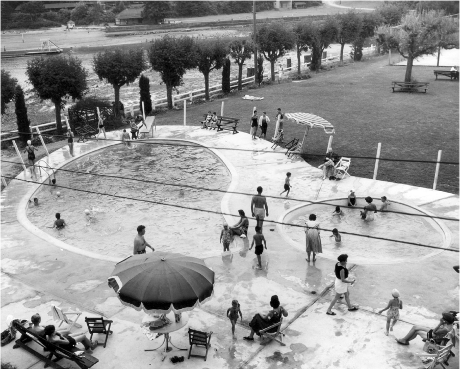
Figure 19. View of adult and children's pools at Bowen Island Inn, ca. 1957. This large pool and patio area illustrates the Union Steamship Company's short-lived attempt to attract a high-paying tourist clientele in the late 1950s.

her history of the island. 74 It was probably no consolation, however, that the resort was a financial failure and that the golf course was never laid out. The hotel closed permanently in 1957, the same year that car ferry service to the island began, with inaugural speakers expressing the hope that Bowen would soon become a suburb of Vancouver. Although the cottages continued to be fully booked, they were offered for sale at a dollar each to anyone who would move one away in order to allow the company to sell its 120 lots for development. 75