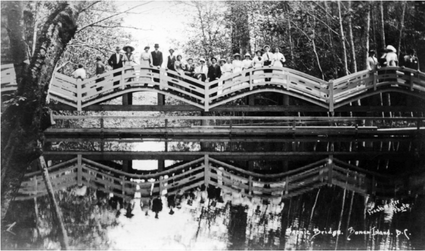
Figure 6. Postcard photo of the 'Japanese Bridge' over Killarney Creek, with the duck pond in the foreground.