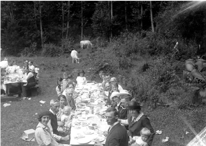
Figure 2. Picnickers and stray cows at the litter-strewn Terminal Steamship Company picnic grounds in Snug Cove, pre-1920.