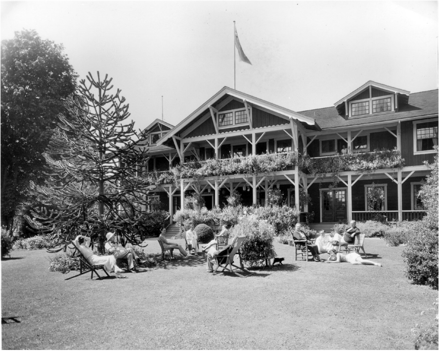
Figure 9. Bowen Island Inn in the 1930s, with exotic young monkey tree.