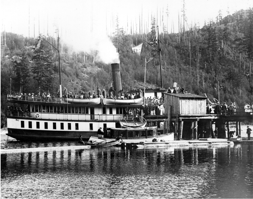
Figure 1. A crowded S.S. Britannia alongside the pier at Bowen Island's Snug Cove, with one of the Sannie foot-passenger ferries and a canoe alongside, pre-1920. Launched by the Terminal Steamship Company in 1902, this was the first vessel to serve the excursion traffic to the island.