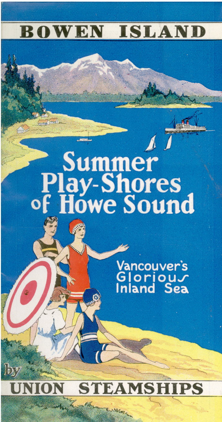
Figure 13. Cover illustration of Union Steamship Co. brochure, 1926. This illustration is transitional in that one of the women remains shielded from the sun.