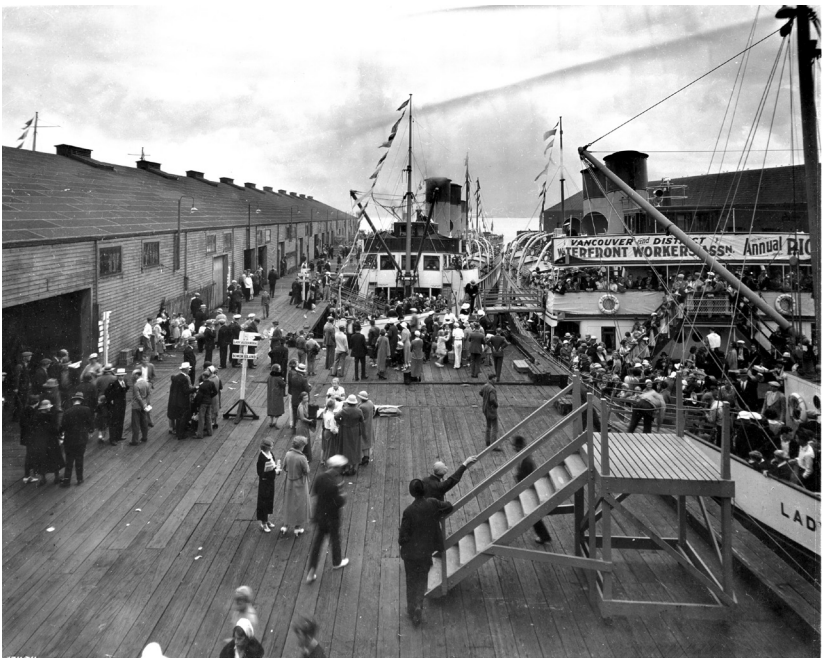
Figure 16. Members and families of the Vancouver and District Waterfront Workers Association at the Union dock in Vancouver and aboard the Lady Alexandra and Lady Cecelia , about to depart for their annual picnic to Bowen Island, 1934.