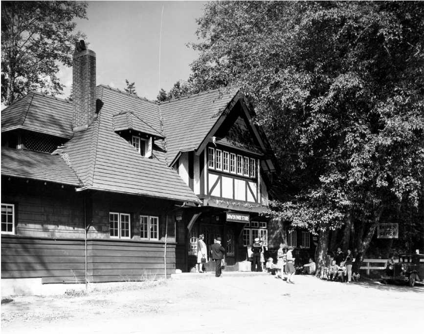
Figure 11. Bowen Park store, ca. 1945. Now serving as the local library, this is the only use building apart from a few cottages and a dormitory to have been preserved.

nostalgic account. 22 Fares were clearly affordable, at ninety cents for a day-trip return ticket, and a moonlight cruise with admission to the dance pavilion costing only one dollar, which represented approximately an hour's labour for the average semi-skilled Vancouver labourer. 23