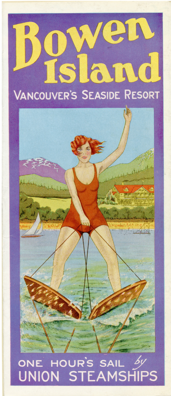
Figure 12. Cover illustration from a Union Steamship Co. brochure, 1931 (reprint from 1930). One of a series of colourful illustrations that focus on athletic and stylish young women.