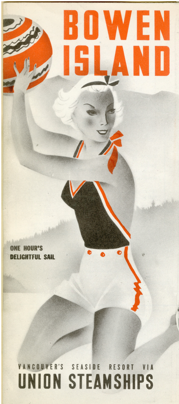
Figure 14. Cover illustration of Union Steamship Co. brochure, 1938. Note that the bathing suit worn by this manicured, tanned, and bleached young woman is not primarily designed for swimming. The shift from the athletic to the strictly sexual female image is already complete by 1938.