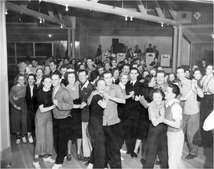
Figure 17. Dance in progress at the Bowen Resort dance pavilion, ca. 1949. Note the long pants worn by most of the women, and the live band in the background.

1941 by the Consolidated Mining and Smelting Company, a subsidiary of the Canadian Pacific Railway, the Union line had purchased four minesweepers after the war for the local passenger service, but, due to high shipyard costs and competition from new rivals, the conversion plans were scrapped and the vessels resold. 63