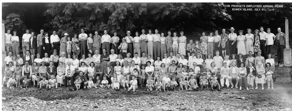
Figure 18. Neon Products Employees Annual Picnic, 9 July 1949. Company picnics invariably featured a group photograph, and some of those in the possession of the Bowen Island Archives are considerably larger than this one. The clothing of most of the adults is less formal than that of the pre-war picnickers, with some of the men proudly displaying bare chests, but there is still a distinct absence of non-white faces.

It was their day. 64 Perhaps less restrained was the picnic held the following month by the city's six hundred outside employees who reportedly "declared goodbye to pick and shovel, scavenging trucks, welding machines! Away for a day in the sun at Bowen Island!" 65 Nineteen fifty-one saw a remarkable forty-nine hundred picnickers invade the island in the nine days between 21 and 29 July. On the Saturday of that week they included 750 United Packinghouse Workers, five hundred members of the City Hall Employees Association, and three hundred members of the Vancouver Motor Employees Club. The following day the "more than 1000 merry makers" included members of "Branch 44, Canadian Legion, Pacific Coast Packers, BC Fir and Cedar Lumber Co., and the United Jewish People's Order." 66 Clearly, then, the picnic grounds of Bowen Island continued to be important sites for workers' recreation as well as for social mixing between diverse cultural groups, though apparently not including those of non-European origin.