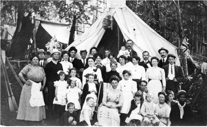
Figure 3. The name above the tent in this undated postcard illustration is 'Sock-Eye Camp,' suggesting that fishing (not fighting) was a favourite occupation for the men, but this was clearly a family experience as well as a social one. The woman with the apron on the left and the dark-skinned young man in the front right also point to the class dimension of this camp.