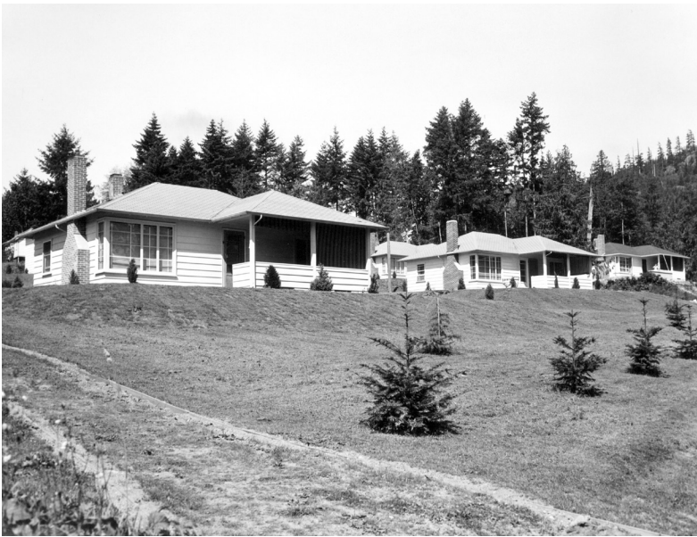
Figure 8. Several of the suburban-like Bowen Island Resort bungalows, with landscaped lawn, ca. 1946.