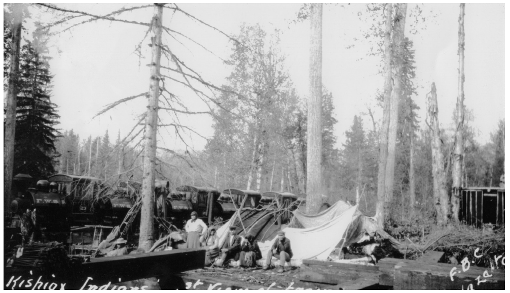
Figure 5. The posture of the Kispiox people when the first GTP construction train arrived suggests their concern about the advance of white settlement.