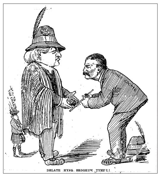
"TRUE, STRONG GRAND CHIEF!" [translation]