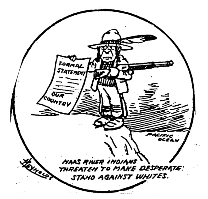
Figure 6. The threat of an uprising attracted attention as suggested by Edward Reynolds's cartoon in the Vancouver Daily Province , 4 June 1910.

that there had been any trouble at Hazelton with the Indians but then contradicted itself, commenting: