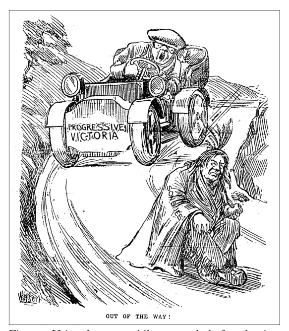
Figure 1. Using the automobile as a symbol of modernity, "Wilson," the Victoria Daily Times ' cartoonist, portrayed the common idea in Victoria that the presence of the Songhees reserve on the inner harbour impeded the city's progress. Victoria Daily Times , 16 May 1910.

the city had "millions of dollars' worth of buildings and stocks, paved streets, electric cars, and all the appearances of modern city life, and ... the other a territory hardly removed from its primitive condition of a hundred years ago." (Figure 1). He questioned why 112 individuals who were occupying 120 acres (48.56 hectares) "should stand in the way of a natural development of ... trade and commerce." Even Gilbert Malcolm Sproat, whose long-time experiences in British Columbia, including membership on the Joint Indian Reserve Commission in the 1870s and being sole commissioner from 1877 to 1880, had made him, "in effect, a defender of Native land rights against the pervasive encroachments of a settler society," was upset. He wrote in the Vancouver Daily World that it was "out of the question" to hold the Songhees