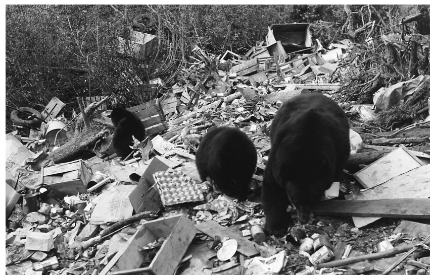
Bears scavenging in the Manning Park dump, early 1950s.

young bear that had been spotted begging for food beside the highway.<sup>41</sup> Unfortunately, the Parks Division did not study animal migration patterns in the park or track mortality rates along the Hope-Princeton corridor during the early 1950s, so it is impossible to calculate the impact of highway traffic on deer, bears, and other wildlife populations. Regarding the seemingly intractable problem of bears' frightening visitors in Manning Park's campgrounds and picnic sites, the chief of the Parks Division could only suggest that one day a nature interpretation centre – another roadside attraction – might be established at the Pinewoods concession complex, "with a summer attendant who should instigate a programme to educate the public not to feed the bears."