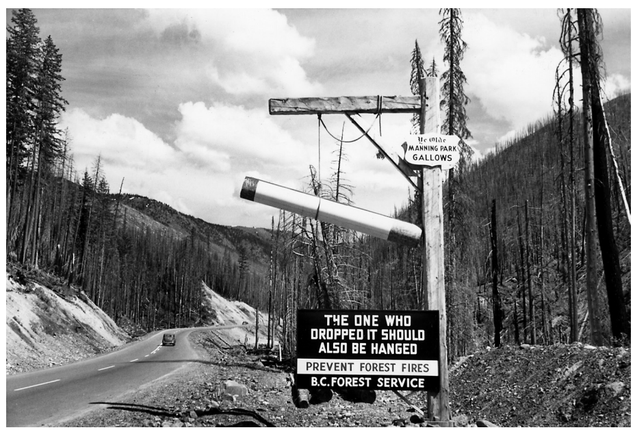
The Manning Park Gallows, with recently paved highway surface.