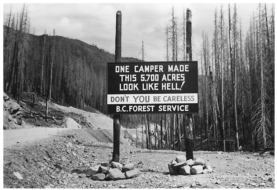
Sign erected at the western edge of the Big Burn, spring 1950. Note the use of snags for signposts and the unpaved road surface.