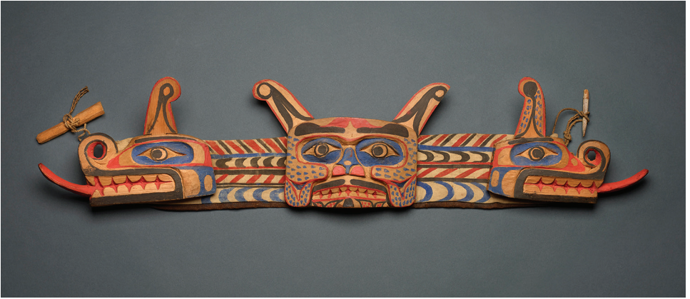
Figure 4. Ceremonial belt worn by a dancer at the Chicago World's Fair, unknown Kwakwaka'wakw maker. Accessioned by the Field Columbian Museum in 1897. Wood, textile, paint, iron alloy, cordage. Courtesy of The Field Museum, Image No. A115416d_003, Cat. No. 18863. Photograph by John Weinstein.

Rupert. A before and after feature allows the viewer to swipe between the original photos and the plates modified for the book, an effective demonstration of the constructed nature of many such illustrations. Some plates are shown to be composite scenes painted from multiple (often unrelated) photo sources. The display succinctly pulls the curtain back on the common artifice of ethnography, and while the constructed nature of certain aspects of the discipline and its photographic documentation has been well rehearsed, the implications have yet to be fully digested. To prove this point, the second gallery closes with a consideration of the impact of Boas and Hunt's research on museums' displays over time. Black-and-white images of Boas, posing for photographs on which to base his well-known Hamat'sa life group, are projected next to a wall-sized photo-reproduction of the diorama. Didactic material breaks down the diorama's elements and its making, and Boas's ghostly form seems to haunt the legacy of the many institutions that reproduced his displays, as demonstrated by a section that is aptly titled "Afterlives in the Museum."