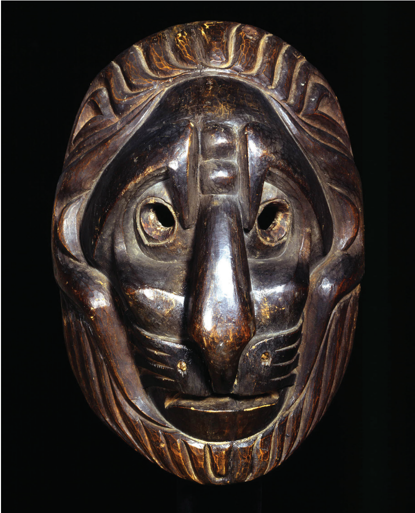
Figure 3. Lion-type Mask, unknown Kwakwaka'wakw maker, 1820–70. Painted (?), carved wood. Courtesy of the Trustees of the British Museum, Am +.436.

depict Sepa'xais (Shining Down Sun Beam), a sky dweller associated with the villages of Quatsino Sound. Boas's own reading of masks and crests relied on formal typologies (in this case, leonine features and a twisted rim motif) that divorced aesthetics from the lived politics of the hereditary relationships, downplaying the notion of masks as cultural property with associated lineages of ownership. Hunt's notes demonstrate how similar-looking objects can have distinct meanings, names, and