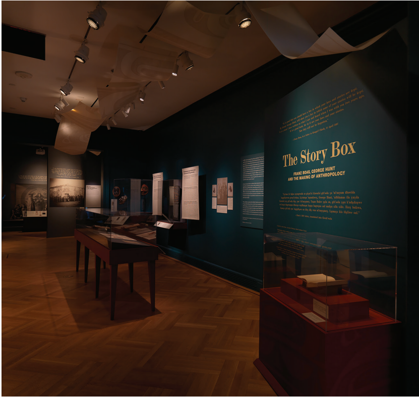
Figure 1. Installation view of Story Box: Franz Boas, George Hunt, and the Making of Anthropology , Bard Graduate Center Gallery, February 14 to July 7, 2019.

a transparency of the anthropological process and a reversal of its hierarchies. By uncovering the layers of dispersed archives that constituted the production of Social Organization , the exhibition and larger project pursue the reconnection and reactivation of the culture knowledge that fills the gildas , or “box of treasures,” of the specific Kwakwaka’wakw families and communities with whom Hunt and Boas worked and from whom they learned.