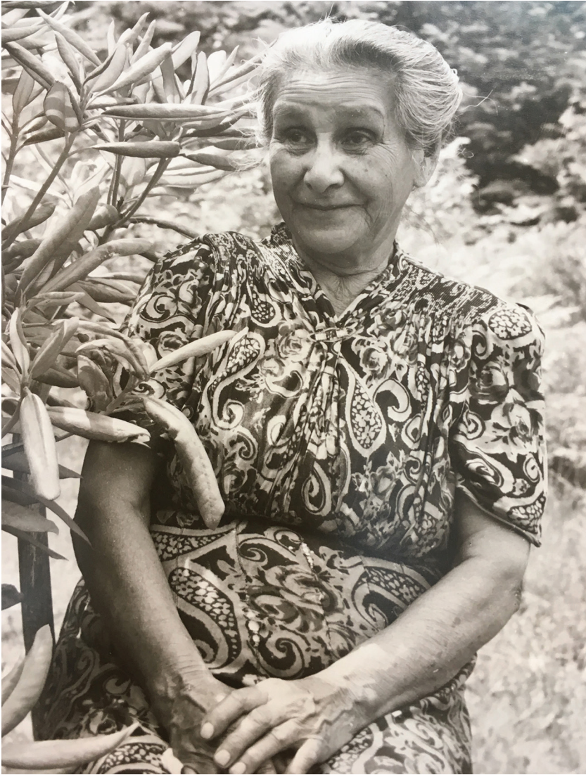
Figure 10. Mali c. 1950.

she adopted and adapted a colonialist convention to present a compelling case for Indigenous traditions and society. In her writings we can read an argument for Indigenous rights and a defence of Indigenous culture.