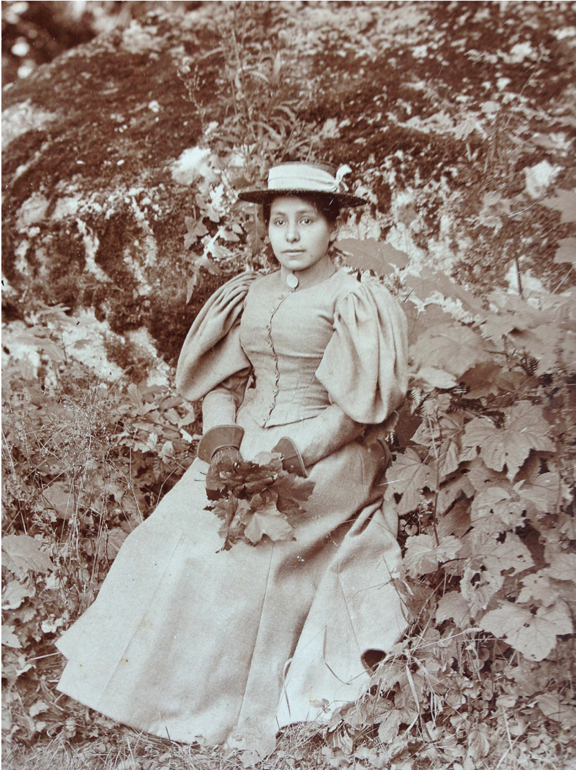
Figure 2. Mali c. 1896.