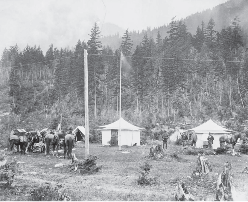
Figure 3. Indian Reserve Commissioners' Camp in Spuzzum, n.d.