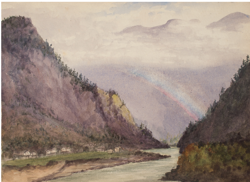
Figure 5. The entrance to the Fraser Canyon showing the town of Yale. Watercolor painted in 1891 by teacher Althea Moody.

for domestic employment. 29 Mali's traditional Nlaka'pamux education began to be overlain by a Western European Christian education and the values that went with it. 30 However, her summer visits home to Spuzzum, sixteen kilometres upriver, meant that she continued to participate in and receive Nlaka'pamux teachings. 31