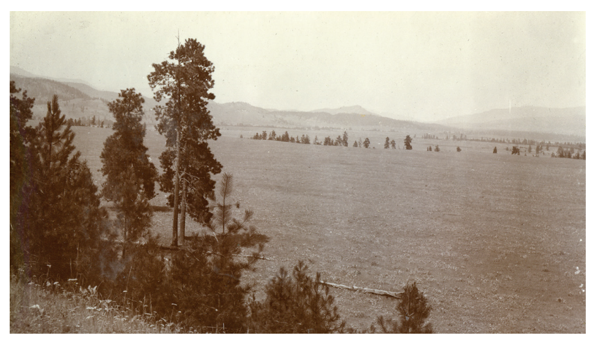
Figure 1. Lequime range on benchland east of Kelowna, ca. 1904.

adjacent benches, they also bought up enough spring/fall grazing land on higher-elevation middle grasslands to block portions of high summer grazing land to general access by other ranchers (Figure 1).<sup>31</sup>