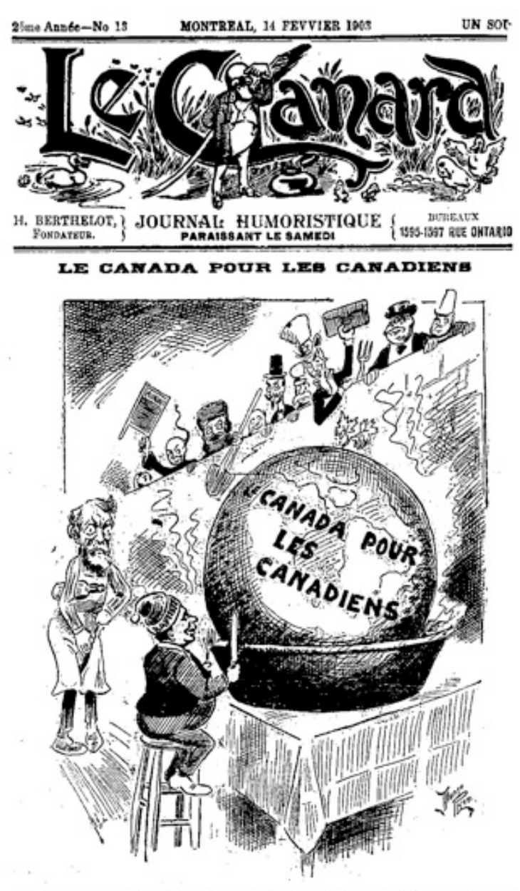
- Blen afr ene je vals me douner une indigestion, si je mange teut cela seul ; je ferala peut-être mieux €leviter mes volsias.