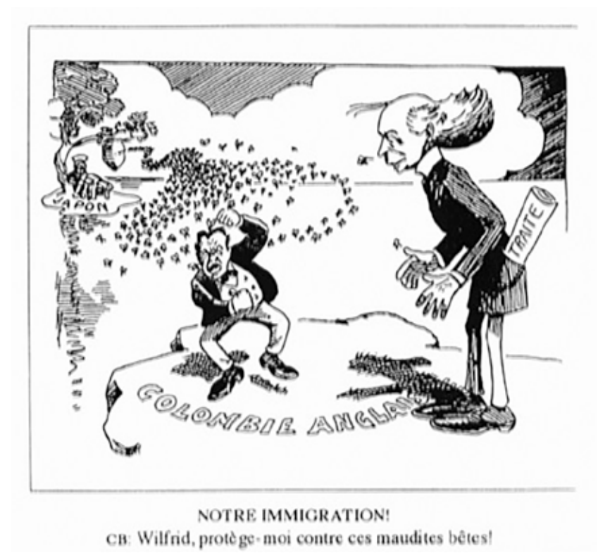
Figure 3. British Columbians plagued with insects from Japan plead with Sir Wilfrid Laurier to protect them. Source: Le Canard , September 1907.

Though the support expressed for Japanese immigration was conditional and self-interested, the editorial dramatized the lack of urgency over immigration restriction that both linguistic groups in Quebec seem to have felt before September 1907.<sup>23</sup>