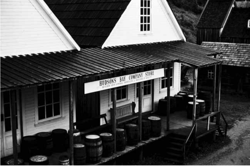
Figure 2. The HBC's store in Barkerville as it looked after its construction in 1868. This rebuilt HBC store existed at Barkerville Historic Town from 1971 to 1979, when it was renamed Mason & Daly General Merchants after the firm that bought the HBC's premises in 1885.