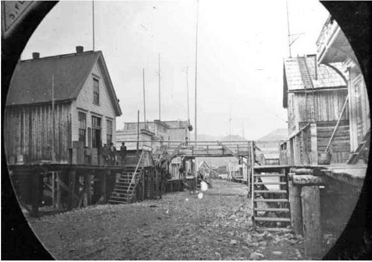
Figure 4. The Main Street, Barkerville, Spring 1883, with the Hudson's Bay Company's store at left. The original caption reads "Street in Barker-ville 83." A lantern slide by Newton & Co., 3 Fleet Street, London. Photographer unknown. Courtesy Richard Wright. See "How to read a historic photograph," http://richardtwright.blogspot.ca/2012/02/reading-historic-photograph.html

increased prices in the less competitive market, 91 but this was somewhat offset by a significant increase in freight charges as the volume of goods flowing into Barkerville shrank. "Freight from Yale to Soda Creek is near ten cents per lb and still rising," Ross reported to Finlayson on 26 August 1871, "and from Quesnel here three cents per lb. Goods will be at famine prices here during the coming winter but will be the means of making a great many leave. They are getting frightened already." 92