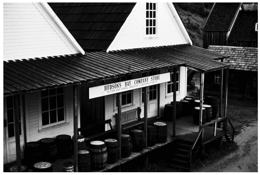
Figure 2. A recreation of the HBC's store in Barkerville, 1975. This rebuilt HBC store existed at Barkerville Historic Town from 1971 to 1979, when it was renamed Mason & Daly General Merchants after the firm that bought the HBC's premises in 1885. BC Government photograph. BCA, I-05300.

total losses sustained by the entire town. <sup>30</sup> Soon after the fire, the HBC was able to reopen for business because the new store, under construction before the fire, had escaped the blaze. <sup>31</sup> Although business was slow for about three months after the fire "owing to the poor assortment of goods left," <sup>32</sup> by April 1869 Wark was pleased with the recovery of business and expected a "good season for mining." <sup>33</sup> Indeed, he commented approvingly, "business is steadily improving here." <sup>34</sup> The store was open from seven in the morning until ten at night, and even in late 1869, when business was "dull," weekly sales totalled approximately twenty-five hundred dollars. <sup>35</sup>