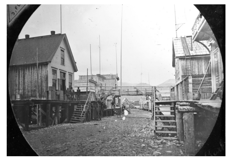
Figure 4. The Main Street, Barkerville, Spring 1883, with the Hudson's Bay Company's store at left, with three men in front, and St. Saviour's Anglican Church in the far distance. The original caption reads "Street in Barker Ville 83." A lantern slide by Newton & Co., 3 Fleet Street, London. Photographer unknown. See "How to read a historic photograph," http://richardtwright. blogspot.ca/2012/02/reading-historic-photograph.html. Photo courtesy of Richard Wright.

blindness and rheumatism.<sup>95</sup> This incident, combined with the constant frustrating and stressful challenges of procuring regular deliveries of supplies, prompted Wark to request a leave of absence in July 1870.<sup>96</sup>