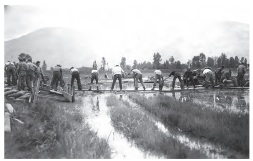
Figure 3. Workers attempt to shore up the river's banks and dikes during floods in 1948. Image courtesy of Creston and District Museum and Archives. From "Agriculture" file, photo no. 3.

bridges, the Goat River diversion, and the vast majority of reclaimed lands. Despite the best efforts of emergency work crews, it was "a stinking mess" (Figure 3).<sup>57</sup> Postwar public hearings also revealed a less than ideal situation, even after the construction of new dikes.<sup>58</sup> In 1950, Mr. Raymond, a farm owner near Duck Lake (also called Sirdar Lake), complained that the reclamation projects had raised water levels and flooded his lands: "I already have two acres under water, and I have still three-quarters of an acre left to live on," he informed those attending a hearing in Creston that year. "I have paid taxes for the two acres under water for the last ten years, and I want to know what way you are going to protect the property owners."<sup>59</sup> A half-dozen nearby landowners faced similar problems.