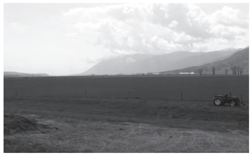
Figure 7. A view of orderly reclaimed fields in Creston.