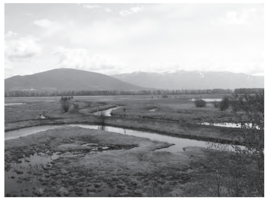
Figure 5. Diking is visible in the present-day CVWMA.

In a painting by Hugh Monahan, noted Irish-Canadian wildlife painter and conservationist, the illustrated Creston Valley is bordered by densely forested mountains, reclaimed fields are scattered around the river like squares of a patchwork quilt, and even tidier larger diked wildlife acreages lie next to the fields (Figure 6). Above both, geese fly over reclaimed fields before reaching the refuge area. Reproduced in a 1974 CVWMA pamphlet, the illustration was accompanied by a poetic text by Yorke Edwards, who notes that controlling the water prevents any disorderly drought and flooding. Instead, "the marshes fill with life, and they become the richest lands in the mountains."<sup>135</sup> The language used to describe the refuge echoes the grandiose descriptions of Guy Constable at his most enthusiastic: even though the land had escaped reclamation for agriculture, it was still embraced in the scheme's rhetoric. At least in Creston, everything ultimately came back to the dikes.