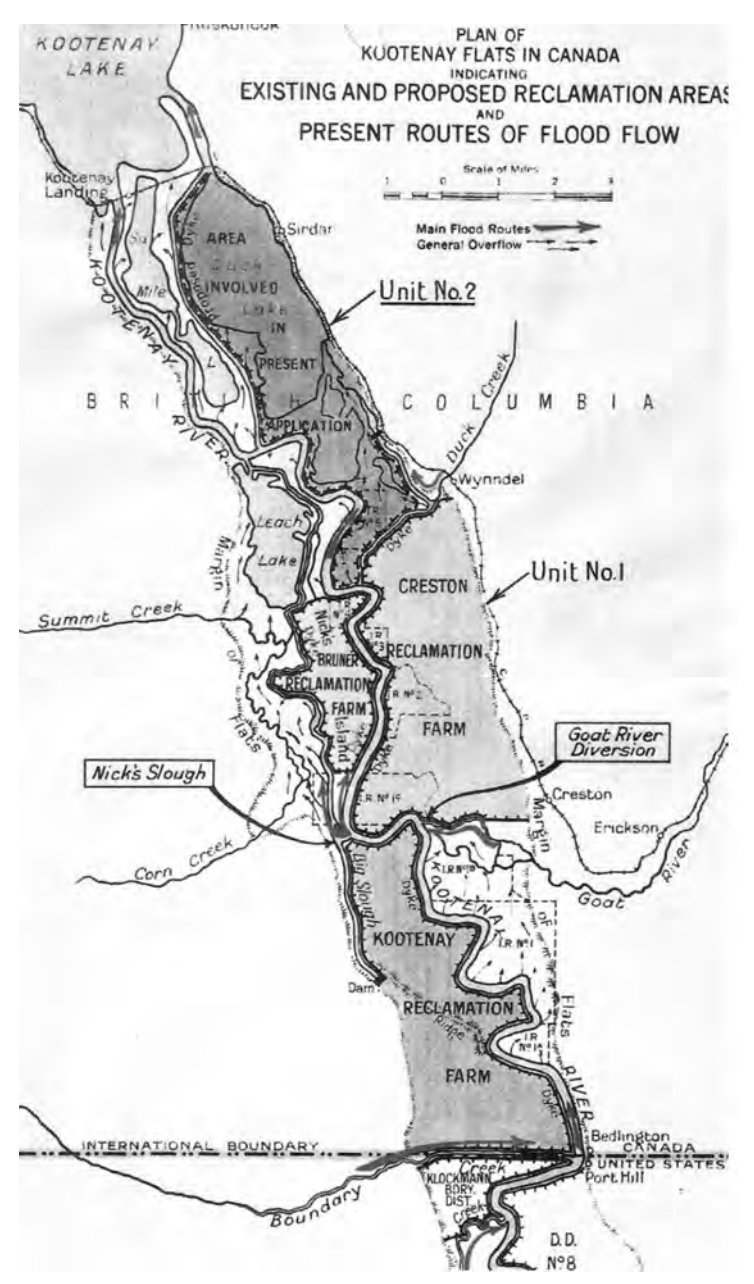
Figure 4. This 1942 map shows existing and planned reclamation schemes along Creston Flats, including those over Duck Lake. Guy Constable, "The Application of Creston Reclamation Company for Permission to Construct Permanent Works Adjacent to Kootenay River," Creston, 1942, I, CDMA, Guy Constable Files, MS-86-72-30, box 30, file I.