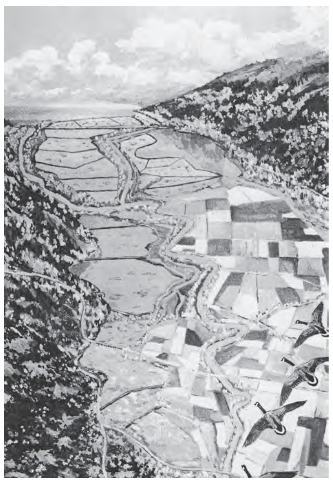
Figure 6. To commemorate the creation of the CVWMA, conservationist artist Hugh Monahan was commissioned to paint this aerial landscape in the 1960s. Image courtesy of the CVWMA and Kevin Monahan. Source : Edwards, Wildness on Creston Flats , 15.