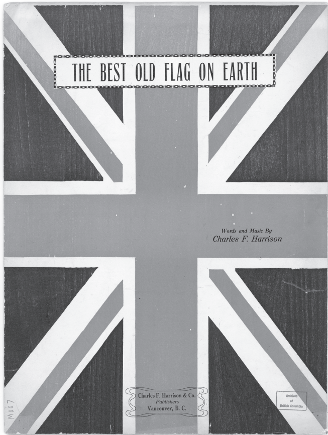
Figure 1. Loyalty and patriotism: Harrison dedicated his first wartime publication to “Canada’s Overseas Contingents.” Image M007 courtesy of Royal BC Museum, BC Archives.

Our emblem dear,” the melody references “The Maple Leaf Forever,” English-speaking Canada’s unofficial anthem of the day. 6 Harrison attended to product promotion as well: copies of “The Best Old Flag on Earth” were available for purchase at Fletcher’s music store in Victoria in early 1915. 7