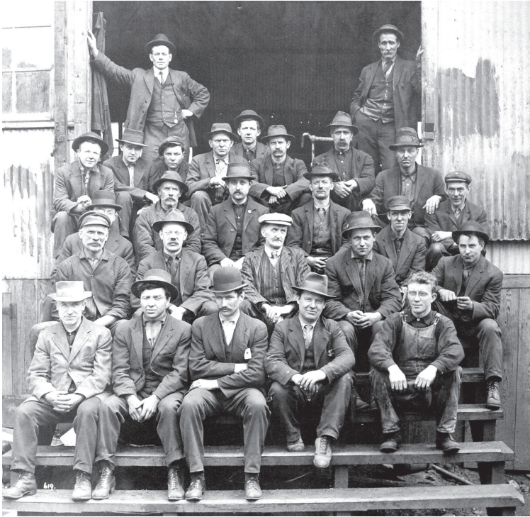
Figure 1. Workers in the pipe shop at Wallace Shipyards. The skilled shipyard worker in British Columbia was typically male with foreign and Canadian practical experience in the industrial field.

forges, industrial machinery, and larger tools powered by pneumatic or electrical means. 22 From the supervising foremen downwards, employees identified with those of similar skill and occupation