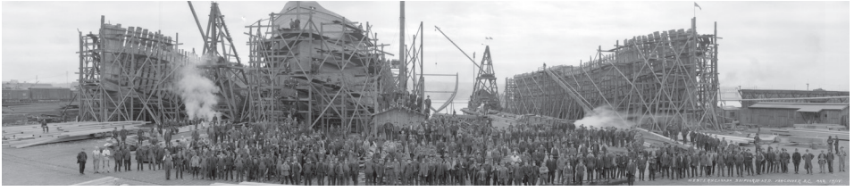
Figure 3. Western Canada Shipyards, located on Vancouver's False Creek, was one of six shipyards engaged in wartime wooden shipbuilding in British Columbia. Facilities were financed and owned by the Imperial Munitions Board.

between planks of wood to make the hull watertight. A good caulker could be paid a dollar or more a day than carpenters.