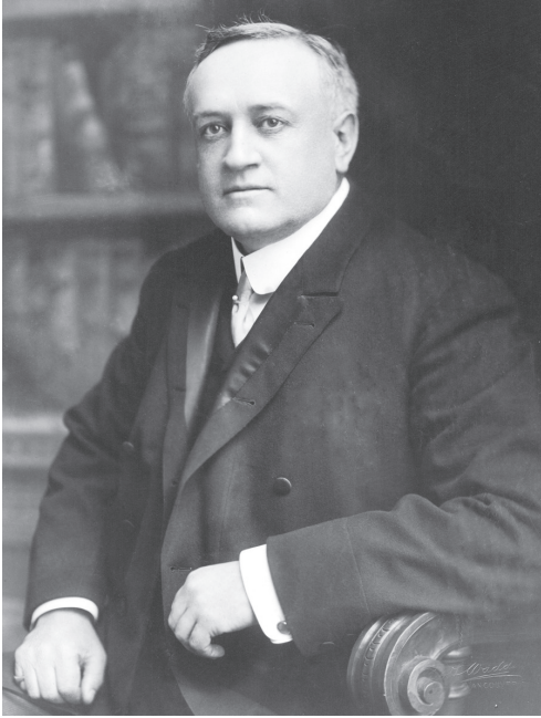
Figure 2. Premier William Bowser encouraged shipbuilding in the province by enacting legislation in 1916 extending subsidies and loans to private companies.

respondent stated: “My advice to the Government is to have nothing to do with the building or operation of ships of any description for mercantile purposes. The present shortage of tonnage is not likely to last for any great length of time, and the probability is that by the time any vessels are built, rates will have dropped to such a large extent that tonnage constructed at present prices would have difficulty in obtaining a fair remuneration for the capital invested.” 28 In other words, there was little consensus with regard to what to do in general, and there was a fair argument to wait until the end of hostilities.