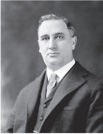
Figure 5. Senator Gideon Robertson, sent from Ottawa by Prime Minister Robert Borden, mediated an end to the major shipyard strike afflicting BC shipyards in May 1918.

signing of the formal agreement between representatives from forty employers and eleven unions at 12:30 AM on 4 June 1918. 104 Most workers returned to the shipyards the same morning. Wallace Shipyards reported that hold-out boilermakers and electrical workers agreed only to 1 August instead of the duration of the war. In details, the agreement provided for an eight-hour day in a forty-four-hour week, pay rates for individual trades based around a six-dollar-per-day basic mechanics wage, double pay for overtime and extra shifts over three days, formation of shop committees with worker representatives, a grievance procedure, revision of wage rates every three months according to cost of living for the duration of the war, and the appointment of an adjuster to consider grievances and disputes. 105 In supplementary agreements, certain shipyards also accepted the presence of a closed shop. New Westminster Construction and Engineering recognized the carpenters union as the main bargaining agent allowed in the shipyard. 106 The Robertson agreement was a workable BC solution to labour relations in the shipyards; it made no reference to the Macy award and its terms were better than those mentioned in the Murphy Report. Most parties were genuinely satisfied with the agreed wage scales and conditions of work, which allowed them to get back to the business of building ships.