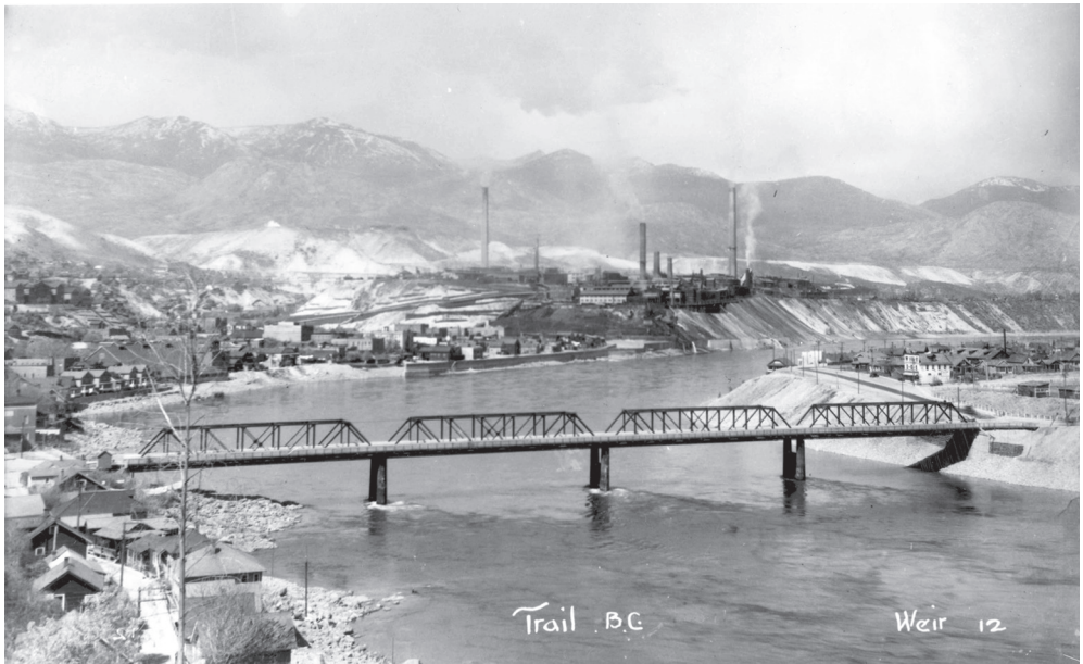
Figure 2. Trail smelter circa 1934. The original smelter was built in the mid-1890s by F. Augustus Heize, one of the Butte, Montana, copper kings.