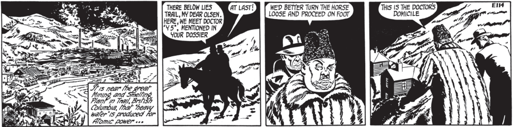
Figure 1. Buck Ryan comes to Trail. A cartoonist from the London Daily Mirror visited the smelter city in late 1945 to gather information about the P9 tower for his powerful cartoon strip. He published thirteen strips in 1946. Permission for use granted by the London Daily Mirror .