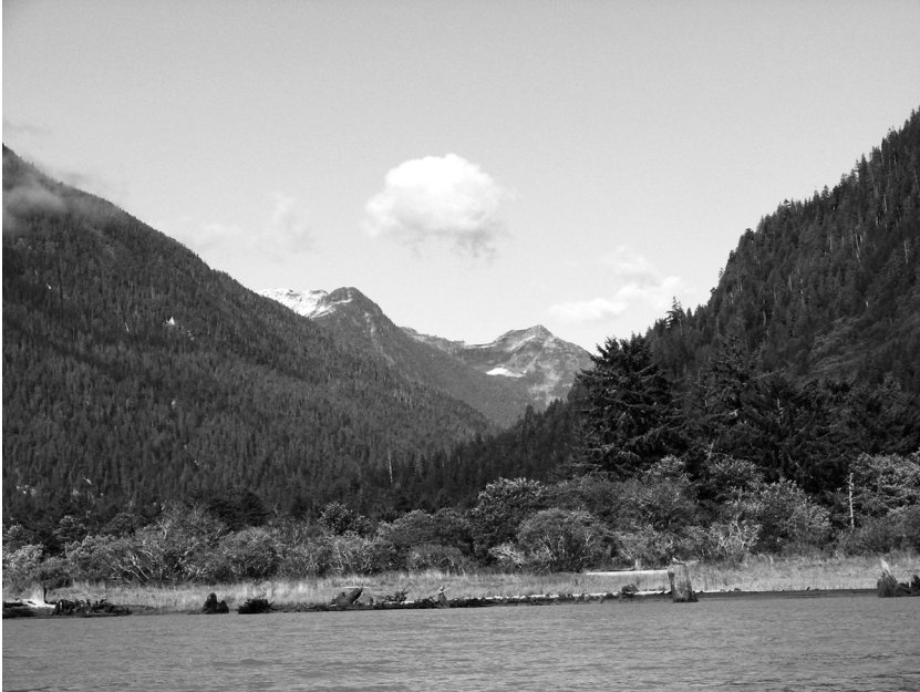
Figure 2. View of Kingcome River Valley, 2008, showing the estuarine flats, forested hillsides, and mountainous backdrop. River delta tidal flats, such as those shown here, were among the few extensive cultivable lands along much of the BC coastline. Prior to European reoccupation, these flats were the locus of a root gardening tradition that was sustained by regular floods and sedimentation and that provided First Nations with one of their principal sources of dietary carbohydrates. During colonial settlement of the coast in the nineteenth and early twentieth centuries, European peoples prioritized these same locales, reoccupying and diking them to support cattle ranches, hay production, and other agricultural pursuits.

item that contributed to its wealth and prestige. Kwaxsistalla, who as a boy participated in all aspects of the garden maintenance and harvesting (Figure 3), recalls: