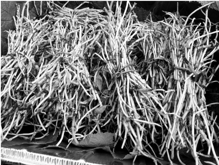
Figure 5. Bundles of springbank clover rhizomes harvested from Kwaxsistalla's family root plot at Kingcome River estuary, prepared for steaming for a feast hosted by Kwaxsistalla in fall, 2008.