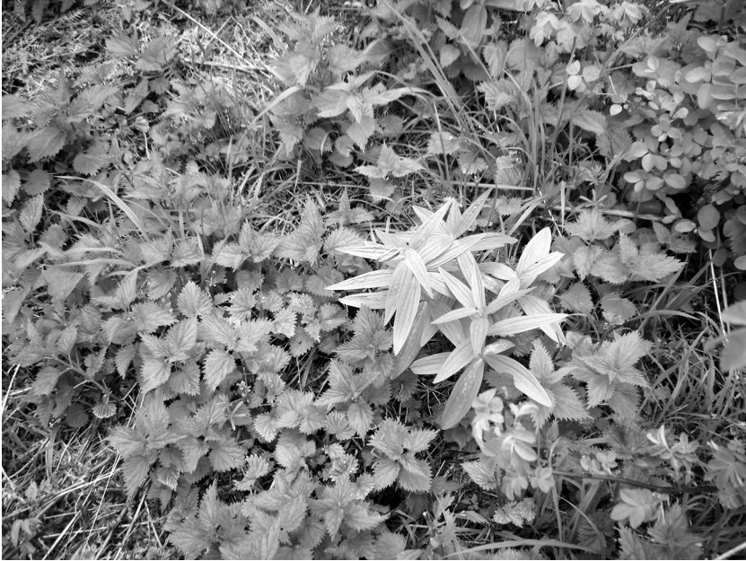
Figure 7. Riceroot ( Fritillaria camschatcensis ) at Robintown, said to have been intentionally transplanted to this site from the Coast, growing together with stinging nettle ( Urtica dioica ), another commonly managed plant (fall 2008).