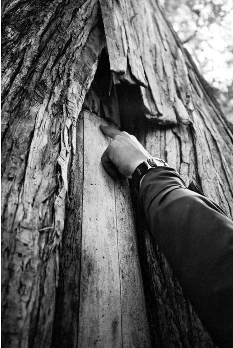
Figure 1. Culturally modified tree, western redcedar ( Thuja plicata ), showing where a bark plank was removed, from Gitga'at (Ts'msyen) territory on the north coast.

Despite early ethnographic observations regarding the widespread abundance of giant cedars (e.g., Drucker 1955, 8; Drucker 1965, 5), cedars are in fact of limited distribution in British Columbia. This local scarcity may have been a motivating force both to adopt practices and principles of cedar management and to trade with neighbours who had greater access to cedar. Indeed, the uneven distribution of usable cedars is likely reflected in the high value of both the canoes carved from giant cedars and the large (two- to four-metre) sheets of cedar bark in Indigenous systems of trade (e.g., some of the references below). The risk taken to transport the bark sheets over sometimes dangerous waters further reflects their commodity value. The need to strip bark from many trees annually, combined with cedar longevity, meant that any accessible tree was likely to be harvested multiple times over the years. Any one of these harvests could kill the tree or make it unsuitable for canoe or large timber use. Thus, cedar would have been overharvested unless landscape-level management practices and ethics were in place. Such a social-ecological context is exemplified by the archaeological survey of groves of bark-stripped cMTs on the Skeena River, within Ts'msyen (Coast Tsimshian) traditional territory.