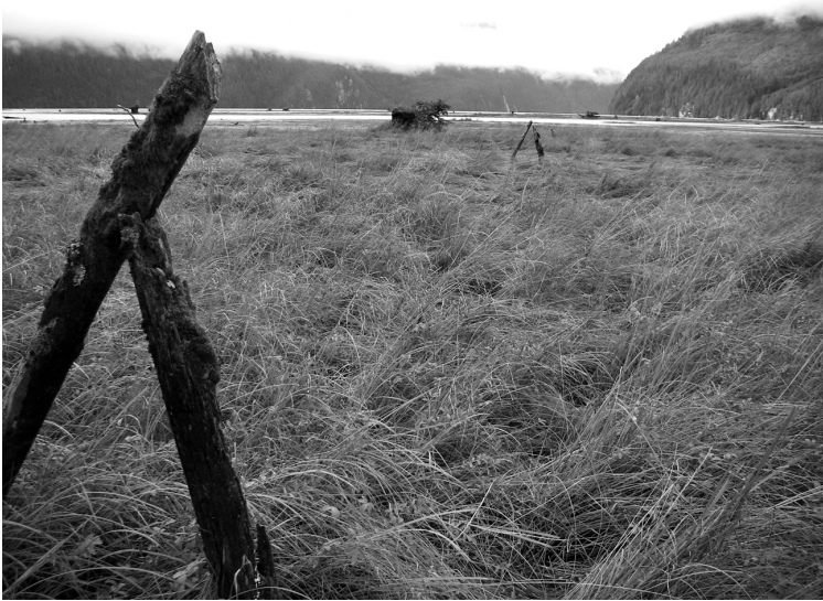
Figure 3. Kingcome estuary, showing posts set generations ago to mark the family-owned root garden plots (fall, 2008).

rocky or high-gradient shorelines, soil might be mounded (Boas 1921, 1934). Archaeological remnants of such rock features can still be found at some ethnographically documented root garden sites, but they have often been confused with stone fishtraps (Deur 2000, 2005).