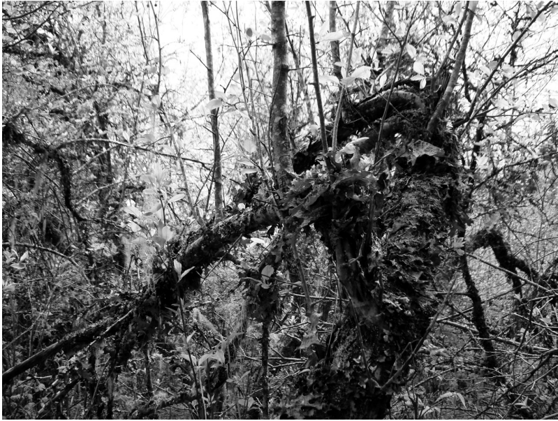
Figure 6. Crabapple ( Malus fusca ) of the Robintown orchard garden, showing how the top was partially lopped many years ago, presumably to make the fruit easier to harvest (fall 2008).

their edible fruits, which were harvested in quantity, stored for winter in boxes with water or grease, and highly regarded as a prestige, trade, and feast food, crabapple trees produce tough wood, which is used for implements, and crabapple bark is commonly used in medicine.