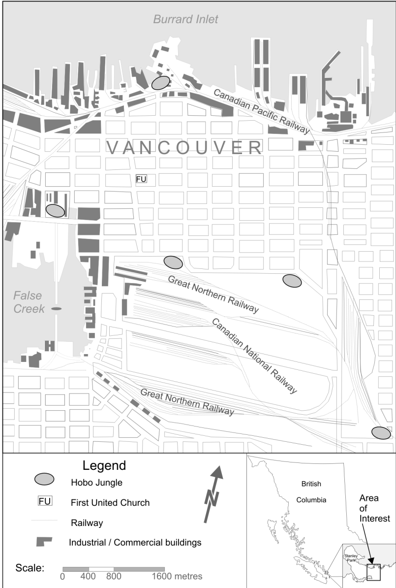
Figure 1: Location of the Jungles, Summer 1931. Cartography by Catherine Griffiths.