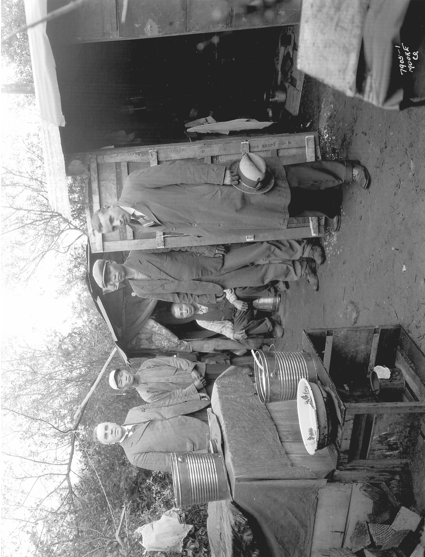
Figure 3: VCA Photo Re N7. A 'Miniature Chinatown.'