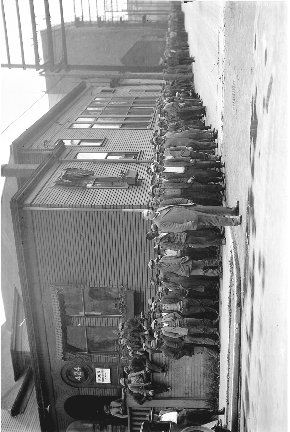
Figure 2: VCA Photo Re N5.1. Roddan and the Record-Setting Day.