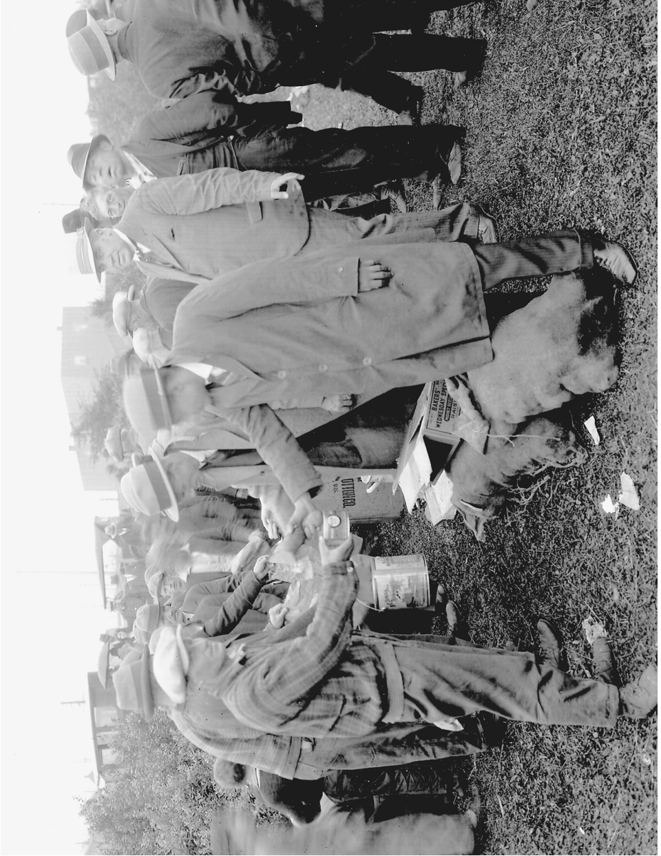
Figure 4: VCA Photo Re N4.3: 'Dishing Up' in the Jungles.