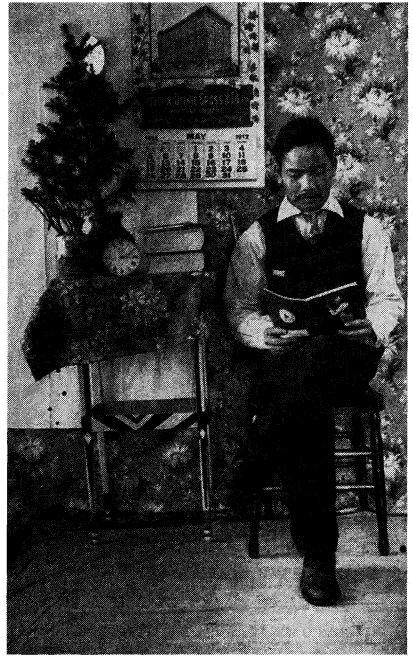
C.D.Hoy, self-portrait, P2064.

THE curvaceous lace-up boots worn by the unidentified elderly Chinese gentleman who is the subject of the photograph reproduced on the cover of Faith Moosang's volume First Son: Portraits by CD Hoy are compelling, as is the range of finery worn by Hoy's subjects: midi skirts secured by buttons and safety pins, fringed gloves, woolly chaps, suspenders, ornate buckles, cabled cardigans, pearl-buttoned blouses, silk umbrellas, embroidered wraps, gold pocket watches. In the background are the incidental and intentional, mass and hand-produced consumer goods – calendars, lithographs, and wrinkled drop cloths. These details, like the debris underfoot, pique curiosity. Access to goods signals the status or occupation of the subject(s), and we marvel at the means by which such items were acquired on remote frontiers. Quesnel-based photographer Chow Dong Hoy (1883-1973) adopted few commercially produced studio props, ubiquitous in urban studios, but the accoutrements Hoy included were significant: suspended