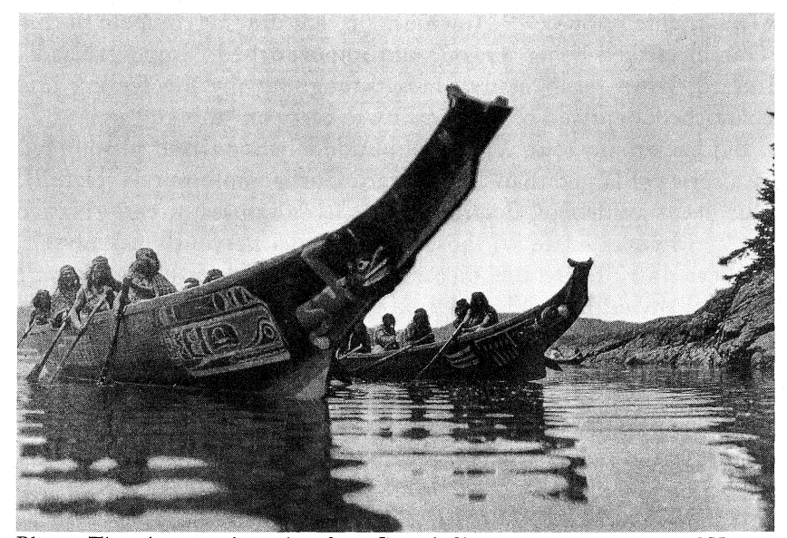
Plate 2: This photograph is taken from Curtis's film, In the Land of the Head Hunters (1914). A short segment of the film featuring the arrival of the canoes replays continuously in the First Peoples exhibit. BC Archives, HP 074718.

not performing one scene "properly" that he actually "dressed-up" in costume and performed the scene himself. Because I knew these details about the film, I could not take it seriously.