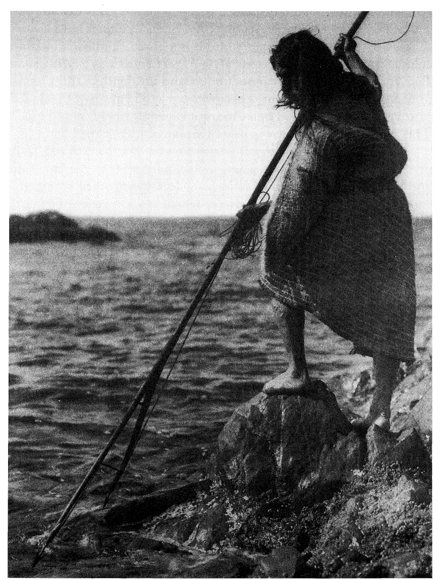
Plate 1: This Edward Curtis photograph is a copy of the first photomural in the pre-contact section. Entitled "Nootkan harpooner, 1915," it appears alongside the Coastal food processing display on the mezzanine level."