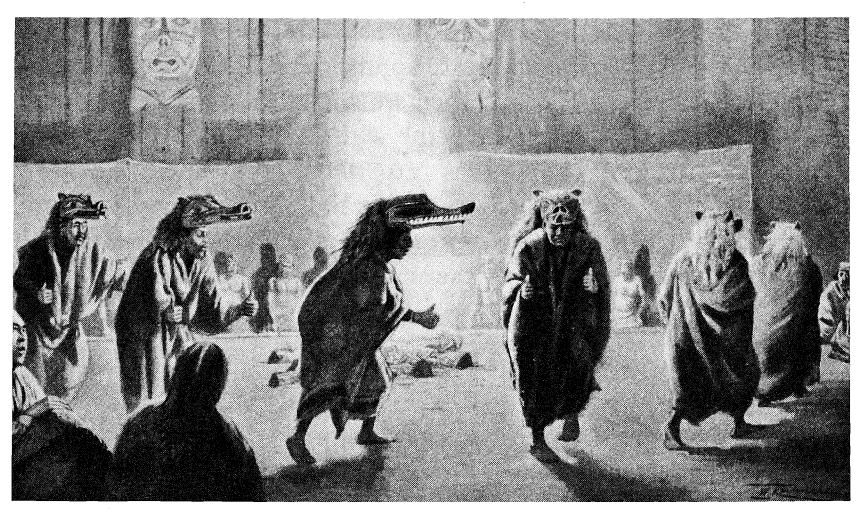
Plate 2: The Wolves' Winter Dance, called Walasaxa?ak ("Great [Dance] from Above,") as performed in the late nineteenth century (from Boas 1897, plate 36).

supposed to understand the Wolf novices' initiation as their personal acquisition of Wolf nature, which will include dressing in a Wolf mask – in their animal form and nature – and obtaining Wolf spirit power. And, perhaps, the final stage of their initiation would consist of being "tamed" and restored to a secular (human) state by the managers of the winter ceremonial.