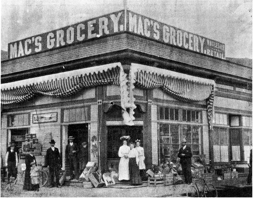
Figure 9 (Mac's Grocery)