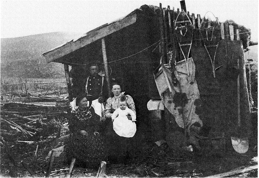
Figure 3 (mining cabin, two women, man, and infant)