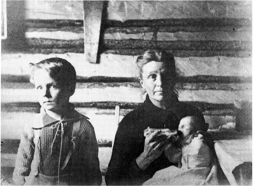
Figure 5 (Woman, child, and infant on the Stewart River)