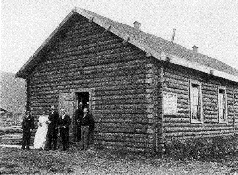
Figure 6 (Wedding, Methodist Church)