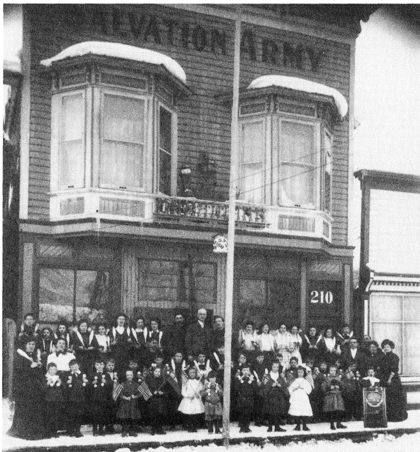
Figure 7 (Salvation Army Hostel)