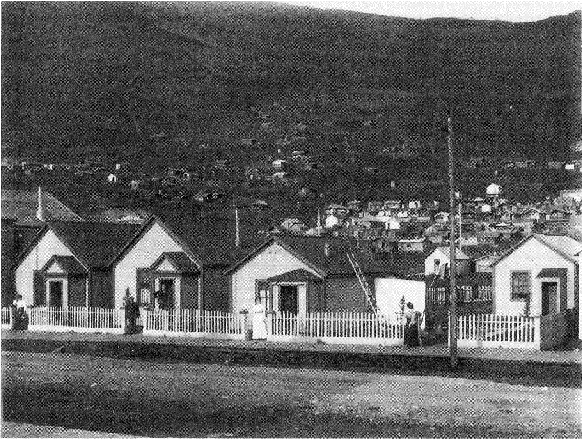
Figure 8 (Dawson Residential Streetscape)