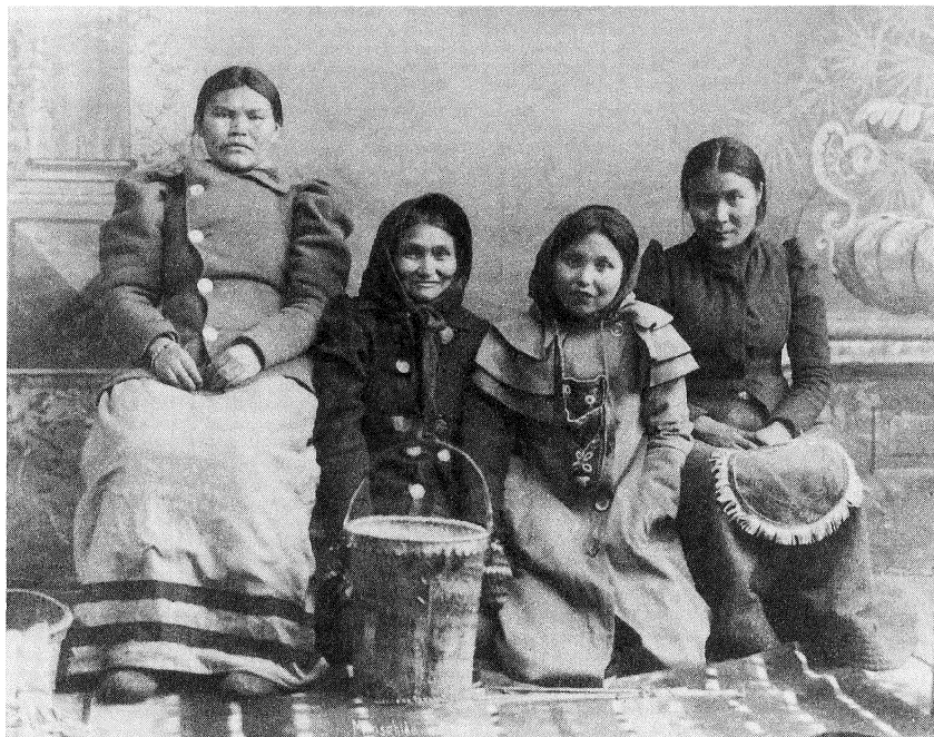
Figure 2: (Moosehide Indian Women)