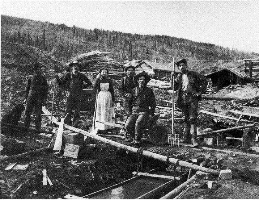
Figure 4 (Group posed in front of sluice)