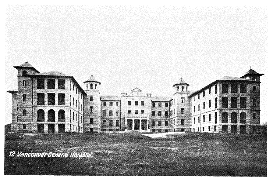
Vancouver General Hospital, ca. 1925