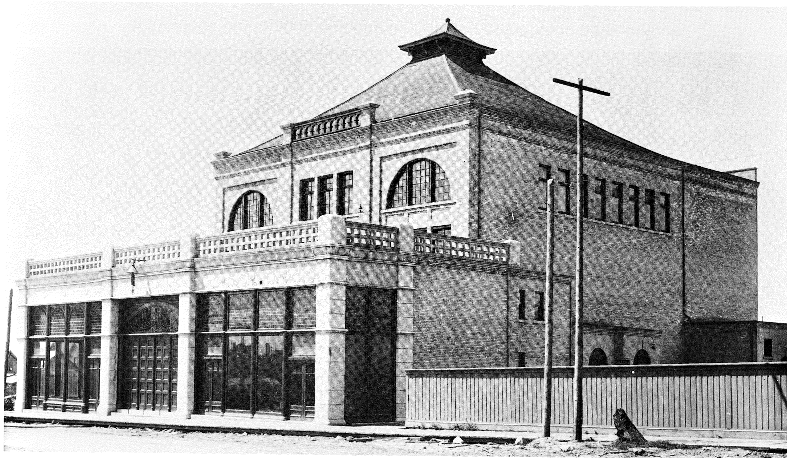
FIGURE 1 The Vancouver Opera House, built by the CPR and opened in February 1891.