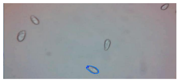
Figure 2. Frame 218 of the video in Fig. 1, showing the use the CellTrack program to track a cell by its outlined cell membrane.