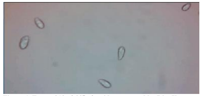
Figure 1. Frame 219 of 445 of a video captured by DinoXcope showing slide 1 of replicate 1 from the distilled water control.

compound microscope (see Figure 1). We prepared three slides for each replicate, and each slide was recorded once for a total of 45 videos. We used two computer programs to analyze the videos and recover the Tetrahymena speed data. We used the program CellTrack (Sacan et al. 2008) to analyse the videos by using the tracking feature of the program (see Figure 2), and as the data was unreliable for fast-moving cells, we also analyzed the videos using the program ImageJ. This program allowed the manual measurement of cell displacement over time between two frames (see Figure 3). We analysed a single cell by each method in each video. With the tracking program we selected the first trackable cell (usually a slow moving cell with a defined outline) that appeared in each video, and with our displacement measures we measured the fastest cell that moved in a straight line. We analysed our data from both methods separately, using 95% confidence intervals to compare between categories of treatments.