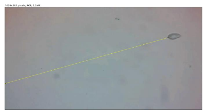
Figure 3. Using ImageJ to determine the distance travelled by a cell.