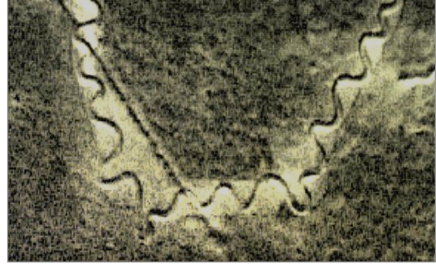
Figure 2. Image of C. elegans movement at 11°C; captured by by DinoXcope at magnification of 10X.