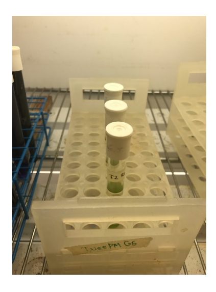
Figure 2. Image of Treatment 2 set up in an incubator. Identical set-up was used for all treatments.

We manually manipulated the photoperiod of Treatment 1 for a nine-day period by removing and replacing the cardboard box. Each Monday, Wednesday, and Friday, we fixed samples of all replicates using the fixing procedure outlined previously; we stored these samples in the BIOL 342 fridge and labelled them with the date, treatment, and replicate number. During this period, we recorded qualitative observations of the level of algae growth, based upon the relative amount of green algae visible in the test tubes. During the weekend, we moved all treatments to the Control incubator, as we were unable to access the lab during these days to manually manipulate the photoperiod of Treatment 1. At the end of the data collection period, we calculated and recorded the C. reinhardtii cell concentration for all the fixed samples, using the counting procedure outlined previously.