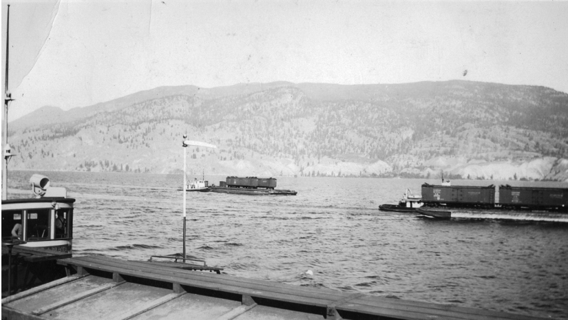
Figure 4. The CNR tugs Radius and Canadian National No. 5 handling fruit on the southern part of Okanagan Lake during the fruit rush, the CPR tug Naramata with barge and railway cars in the foreground, 1930s or 1940s.

of the Board of Railway Commissioners, the shippers, including the Occidental Fruit Company and the Penticton Co-operative Growers, argued for direct CNR connections to CNR towns in the Prairies. 123 The Board of Railway Commissioners cited figures presented by Associated Growers and the Occidental Fruit Company to show the volume of traffic disadvantaged by a “two-line haul” (i.e., a shipment to a Prairie point that required using both CPR and CNR trackage to reach a CNR destination). 124