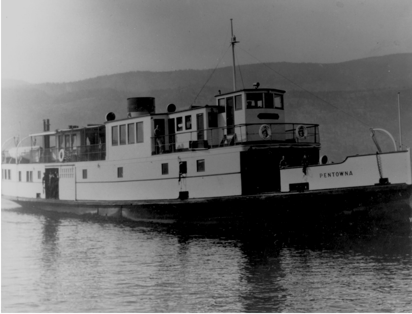
Figure 3. The CNR's MV Pentownna arriving at the CNR dock at Kelowna, late 1920s or early 1930s. The door on the freight deck is already open. Source: Kelowna Museum & Archives, 6260.

barge network. It gradually expanded its new network chiefly by looking for places where the CPR had not enhanced its sternwheeler service with barges and barge slips. Although the CPR had built barge slips in Kelowna, Summerland, and Penticton before the First World War, and at Okanagan Centre in 1919, some of the smaller farming communities along the lake – Naramata, Peachland, and Westbank – still had to rely on the inefficient sternwheelers or on railway barges that had to be hand-loaded at the dock. 114 The CNR set out to fill the gap. In early September 1927, it launched a six-car railway barge at Kelowna and added a new barge slip just to the north of its passenger wharf. 115 By the summer of 1928, the CNR had launched the tug Radius at Kelowna, and shortly afterwards, the new tug shepherded the first barge shipment of fruit – a carload of pears, plums, and peaches – from the newly completed