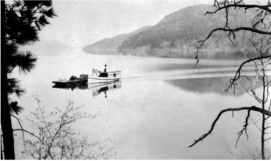
Figure 1. The steamer Maude Allen with a freight scow on Kalamalka (Long) Lake, near Oyama, 1910s.