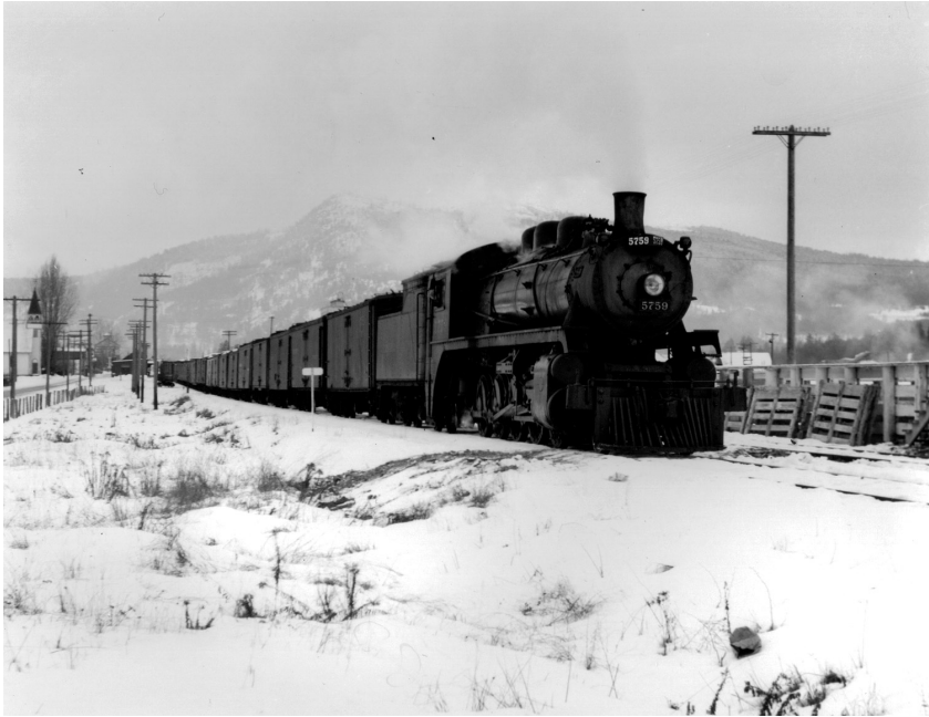
Figure 5. A CPR fruit train with refrigerator cars northbound on the outskirts of Armstrong, 1940s.

occasions, we would have six or eight cars partially loaded and waiting for items that came in on the old Sicamous or the Pentowna . 135