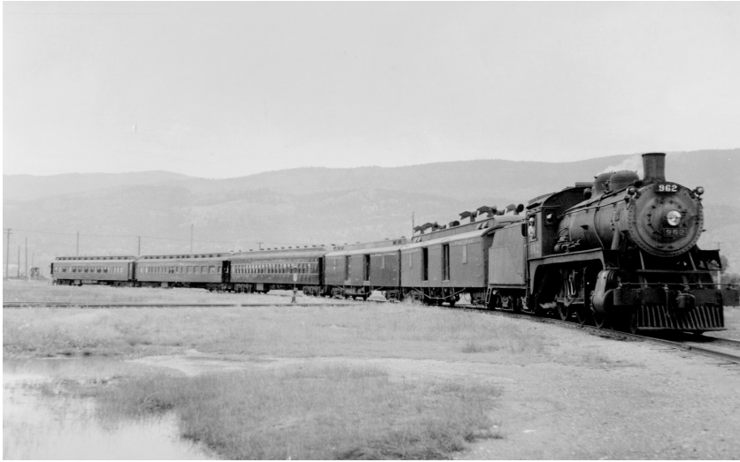
Figure 6. CPR passenger train, with a ventilated fruit express car behind the locomotive and tender, at Kelowna, 1940s. The train has turned around in the lakefront cnr yard and is heading back to the CNR station on Ellis Street to pick up passengers, mail, and freight for the trip north to Sicamous.

whether the CPR, acting on its own, would have felt the need to make the major capital investment required to relocate its railway and barge network to Kelowna. Moreover, there would have been little pressure on the company to make immediate investment for better services for the more marginal and isolated fruit-growing centres.