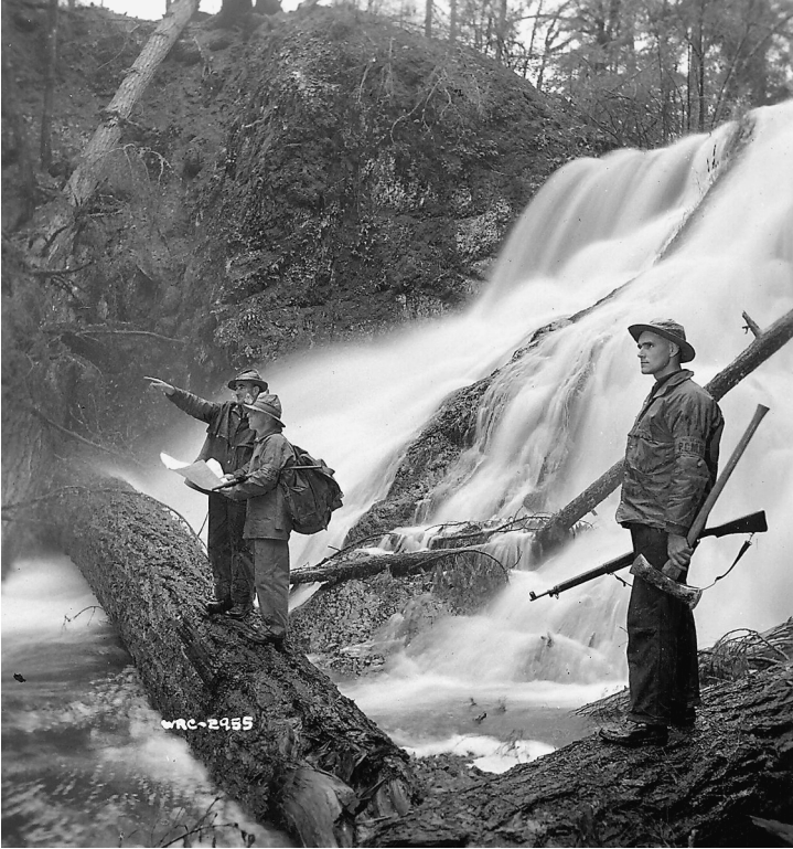
Figure 6: The original caption to this publicity photograph reads: "Typical of the terrain of the Pacific Coast which these men patrol is this scene. These men may spend three or four days 'on the trail' without blankets, sleeping in improvised shelters." PCMR publicity photograph, November 1942, private collection.

themselves from Indians has there existed such an economical form of defence." 110 At scant cost to the public purse, the Rangers continued to play valuable roles in keeping isolated parts of British Columbia and the coast under constant surveillance, searching for lost planes and people in the mountains, and even tracking down escaped prisoners of war or army deserters. 111 In December 1944, however, as Allied offensives in the European and Pacific theatres pushed the Axis powers back on their