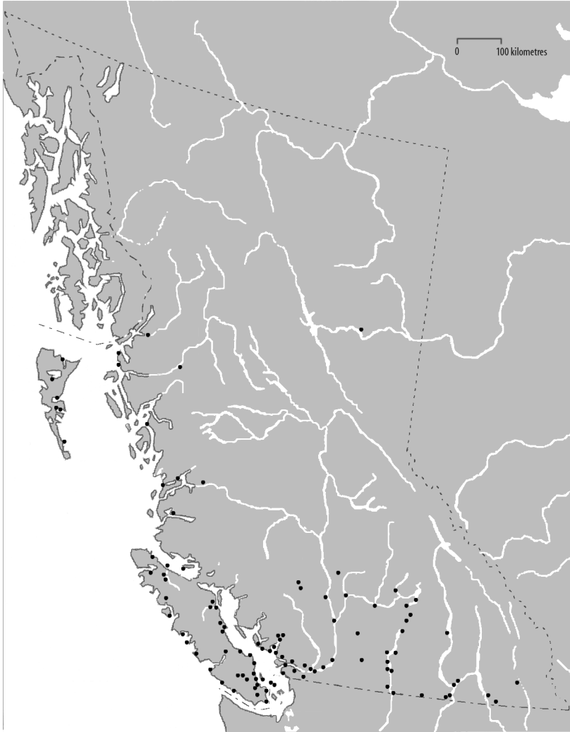
Figure 2: Map of P.C.M.R. units, 1943. Map by Jennifer Arthur-Lackenbauer based upon map, "Location of P.C.M.R. Company Headquarters," n.d. (c.1945) DHH 159 (D1).

The government did not provide them with horses or saddles, vehicles, clothing, or regimental equipment; for the most part, these volunteers were expected to use their private assets for transportation and subsistence. So that they would be distinguishable from ordinary civilians, the original directive recommended that members be given armbands and steel helmets but not military uniforms. Furthermore, they were to receive limited supplies of arms and ammunitions to carry out their