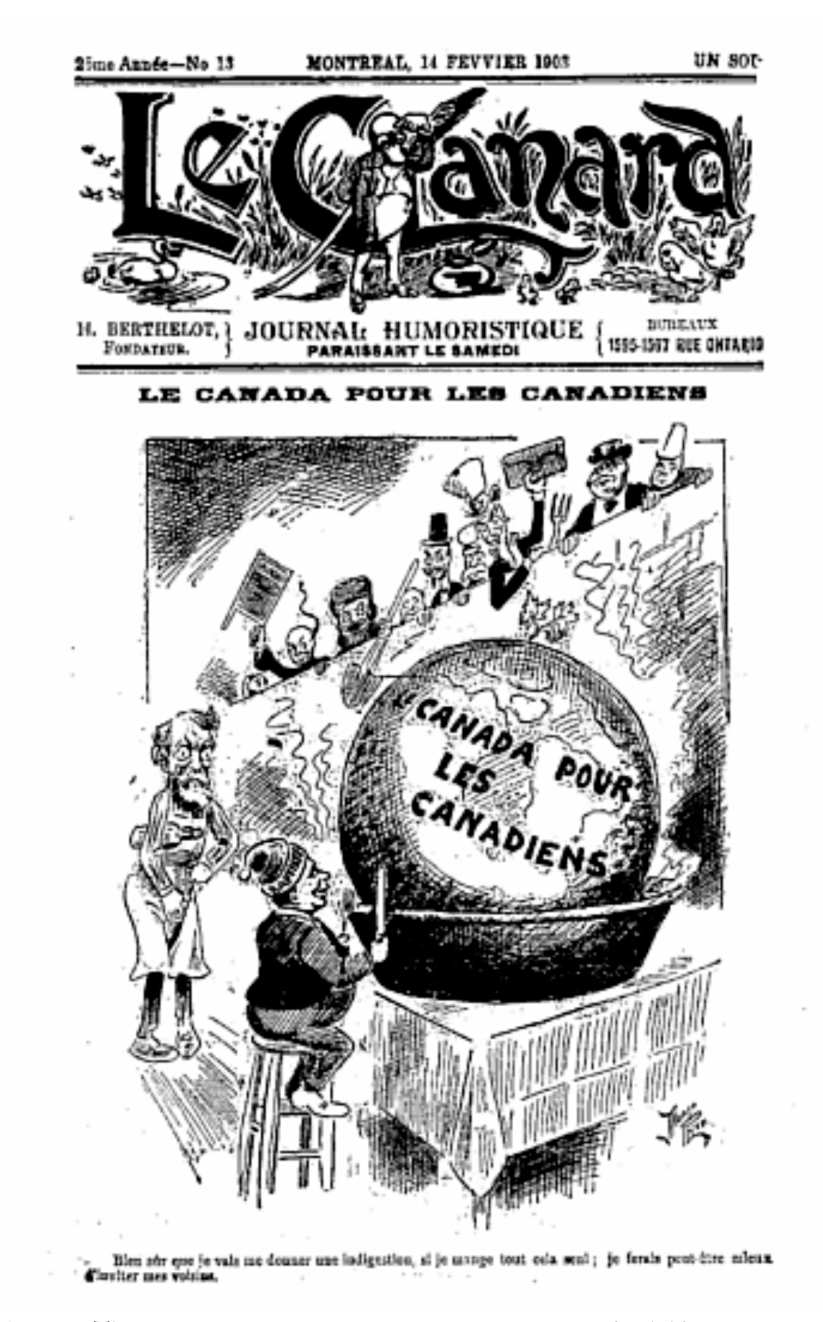
Figure 2. This time Le Canard satirizes restrictionists as greedy children.