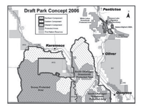
Figure 4. Park concept area, 2006.

risk.<sup>28</sup> The Okanagan-Similkameen is "one of Canada's richest areas of natural biodiversity," as would be the park reserve.<sup>29</sup>