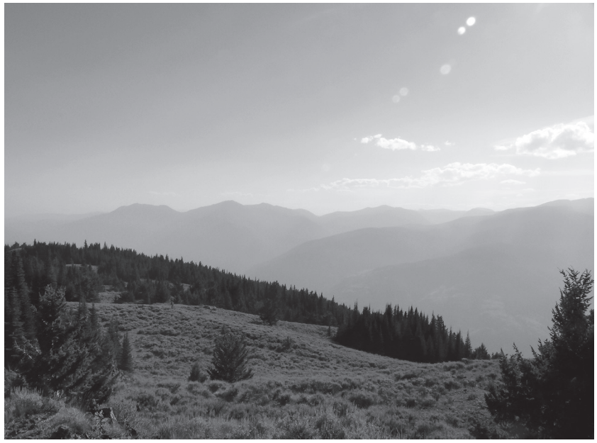
Figure 1. The top of Mount Kobau.

The lands within the proposed park boundaries are under pressure as development creeps up the slopes of the hills on the western side of the Okanagan.