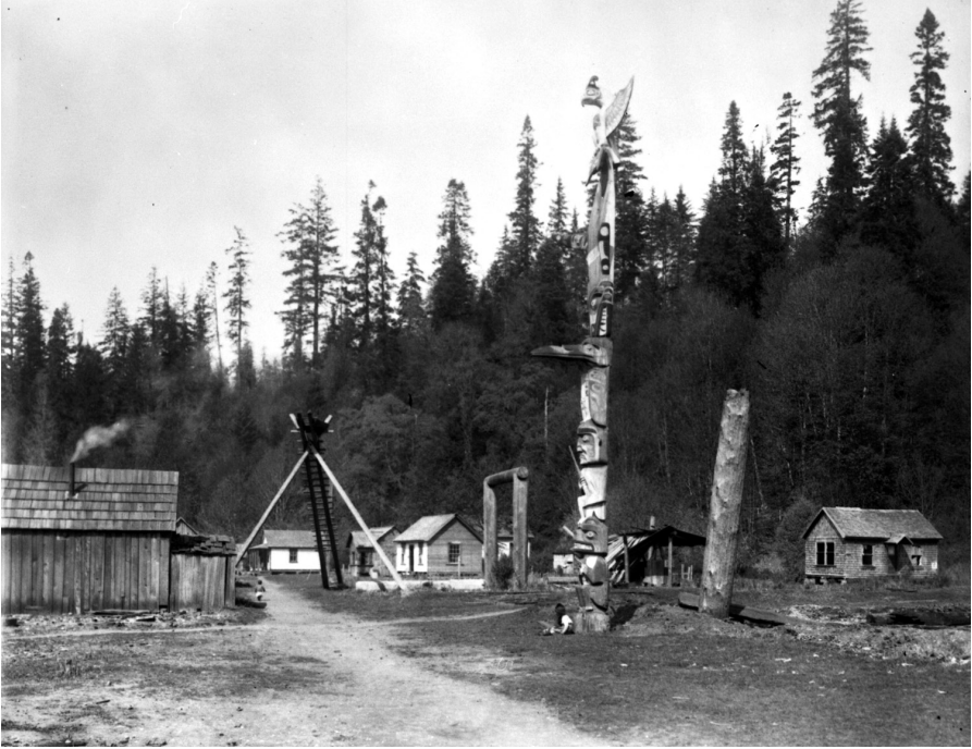
Figure 1. Watchman's pole, Cape Mudge, c. 1925.

pole: "My schools of salmon are coming to my salmon weir here, chiefs" (Boas 1925, 153). From this position, that watchman directed the chiefs to check their traps for salmon. He then sang to the salmon: