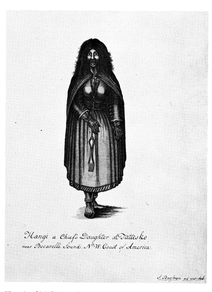
Hangi a Chief's Daughter . . . 27 x 21.4 cm, watercolour From the Collection of Mr. Paul Mellon

Cunnyha an Indian Chief . . . 31.4 x 22.6 cm, watercolour From the Collection of Mr. Paul Mellon